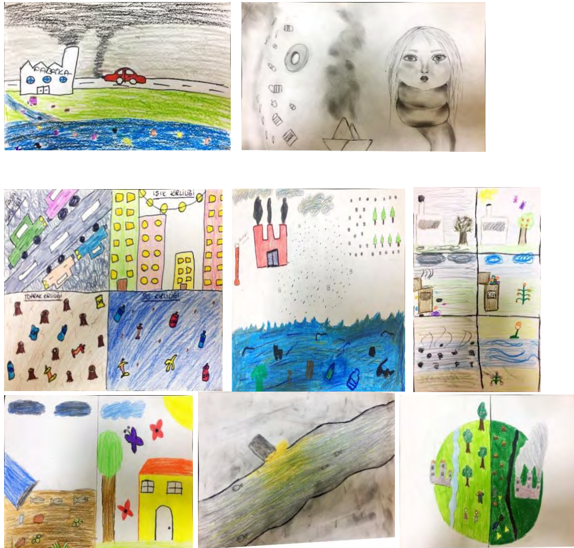
Figure 1. Samples of 'Environmental Pollution' Themed Pictures by the Pupils

It was aimed in this study to reveal the pupils' perceptions of environmental pollution. To this end, they were asked to draw environmental pollution themed pictures. Samples of the pupils' drawings are presented in Figure 1.