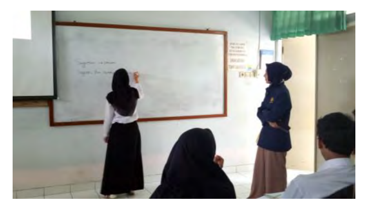
Figure 3. Answering question activity

Finally, Figure 3 ilustrates when the students have the opportunity to answer the lecturer's questions. Students are asked to come forward and write their answers on the board using upright letters.