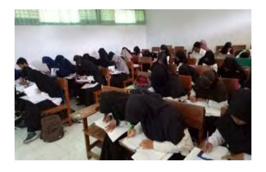
Figure 2. Evaluation activity

Furthermore, Figure 2 shows a picture of the students' activity when working on the assignment. It was seen that all students were serious in doing the cursive handwriting assignments.