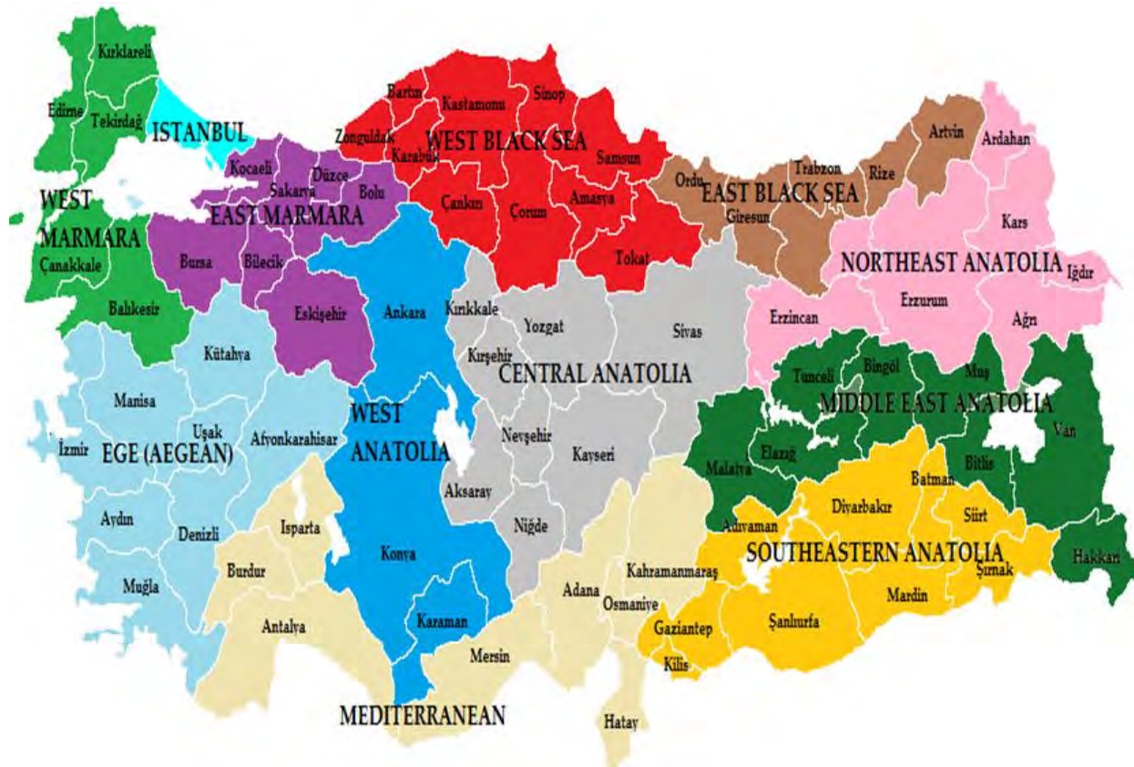
Figure-2. TSI Turkey level-1 statistical area classification.

Level 1 (NUTS 1 Nomenclature of Territorial Units for Statistics) regional classification determined by TSI (Turkey Statistical Institute) taken as a basis in determining the maximum variation sample. These regions determined in 2002 within the framework of European Union harmonization. Figure 2 shows this region classification.