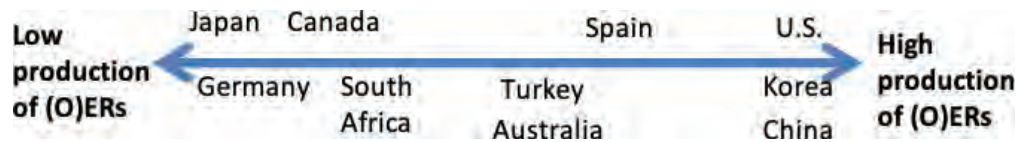
Figure 4: Spectrum Low production of (O)ER - High production of (O)ER.

two of the most popular OER initiatives in HE. The U.S., South Korea and China are high producers of (O)ER, whereas countries such as Japan and Germany are producing less OER at the national level, despite their position in the IDI 2017 rank. Furthermore, Canada and the U.S. are considered the OER pioneers, and many of their initiatives have been popularised and replicated in other countries. Examples are the Canadian Connectivism and Connective Knowledge MOOC (2008) and the popular U.S. MIT Open Courseware (2001).