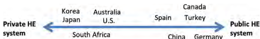
Figure 2: Spectrum Private HE system - Public HE system.

The differentiation between private and public HE systems is also relevant in understanding the differences between these countries (see Figure 2). On the extreme left of the spectrum, approximately 80% of HEIs in South Korea and Japan are private, and so too are around 62% of HEIs in the U.S., both non-profit and for profit. In South Africa, only 23 out of 143 HEIs are state-funded and the rest are private (84%). On the other extreme of the spectrum, the majority of German and 75% of the Chinese HEIs are state-funded, with HEIs in China affiliated with the Chinese Ministry of Education, with other ministries or with provincial governments. Turkey and Spain have a higher number of public HEIs than private ones: Turkey has 129 public universities, 71 non-profit foundation universities and 5 foundation vocational schools, whereas Spain has 2,230 public HEIs, 50 of which are universities 1 , and 34% of the HEIs are private (n = 1,145, 34 universities).