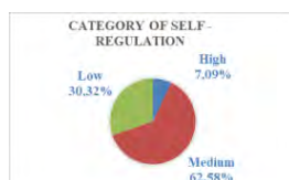
Figure 2. Diagram of the self-regulation classification

Explanation: X is the score of students' self regulation