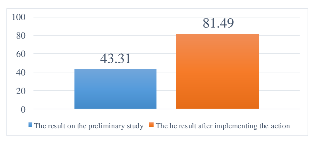
Figure 2. The Mean Scores of before and after the Action

After the implementation of VAK learning model the minimum mastery criteria was reached by the students. The action was considered successful since \geq 70 of the students achieved the minimum mastery criteria which was 75. Based on the findings, the number of the students who were able to achieve or pass the minimum mastery criteria after the implementation of VAK learning model was 19 students (73.07%). It proved that the strategy of integrating the VAK learning model was successful in developing the students writing' skill in writing descriptive texts.