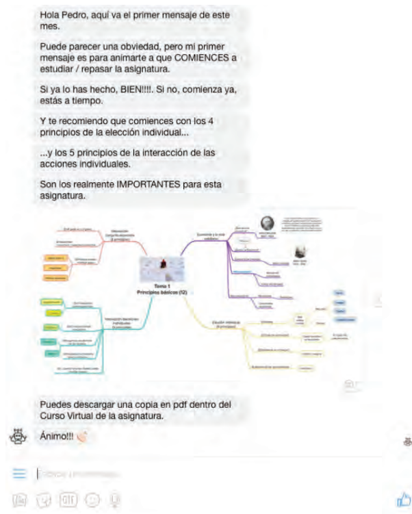
Figure 2: Image of the first message sent by EconBot with a reminder of important concepts and relationships of the first topic of the course (in Spanish).