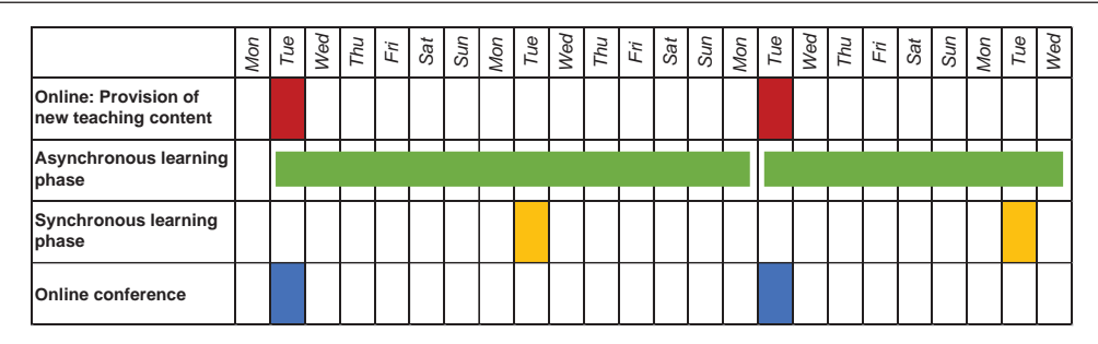
Figure 2: Elements of the different units

The structure of the course consisted of different units with varying inputs from the teachers in Germany and Japan, and provided online material (on an e-learning platform), asynchronous phases of learning and preparation of group inputs, and synchronous online meetings for questions and online conferences. All participants met online at least every two weeks (see Figure 2).