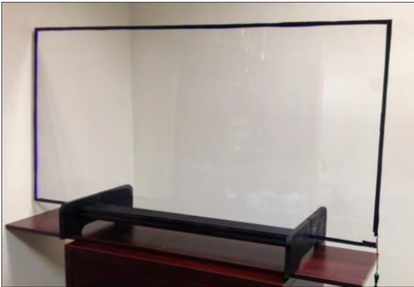
FIGURE 3. The small-scale Lightboard constructed for the pilot was propped upright in a wooden stand.