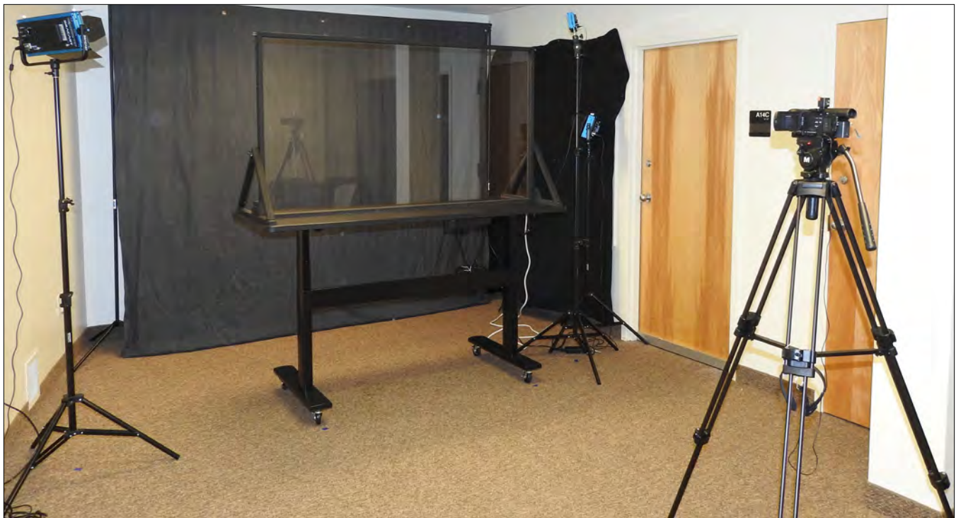
FIGURE 5. A dedicated space was required to house the Lightboard and associated equipment. A charcoal grey background was selected to complement a variety of hair and skin tones.