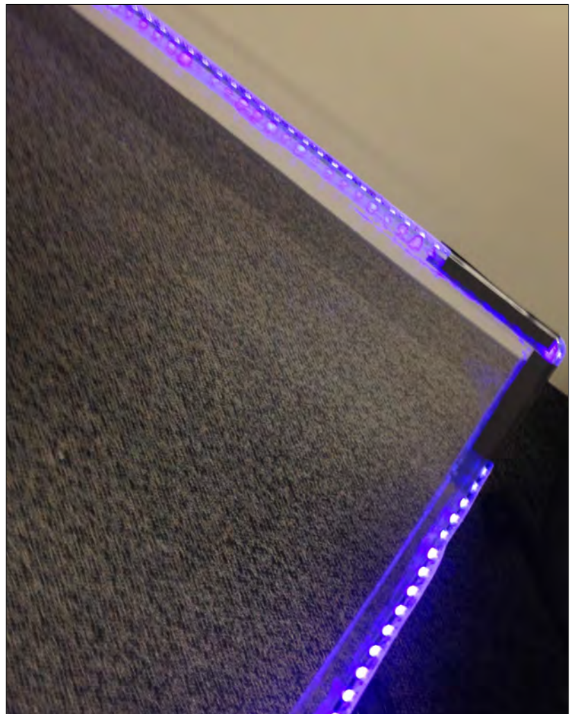
FIGURE 2. LED strip lights are pressed to the edge of the glass and secured with electrical tape during the pilot.

Faculty of the undergraduate college who self-elect to teach an online, hybrid or flipped classroom course were often technologically savvy and eager to learn new instructional technology skills. These same faculty shared their online teaching techniques, projects, and successes with other faculty at all levels of the university, resulting in an increased interest in the development of instructional media. The teaching and learning center supported faculty in their instructional media development through hands-on workshops exploring Web 2.0 tools for teaching and learning. While searching for easy to use technology solutions to enable faculty media production, the Lightboard was identified by the authors as one possibility. The authors' goal was to empower our less technologically savvy faculty to confidently produce instructional media for their students.