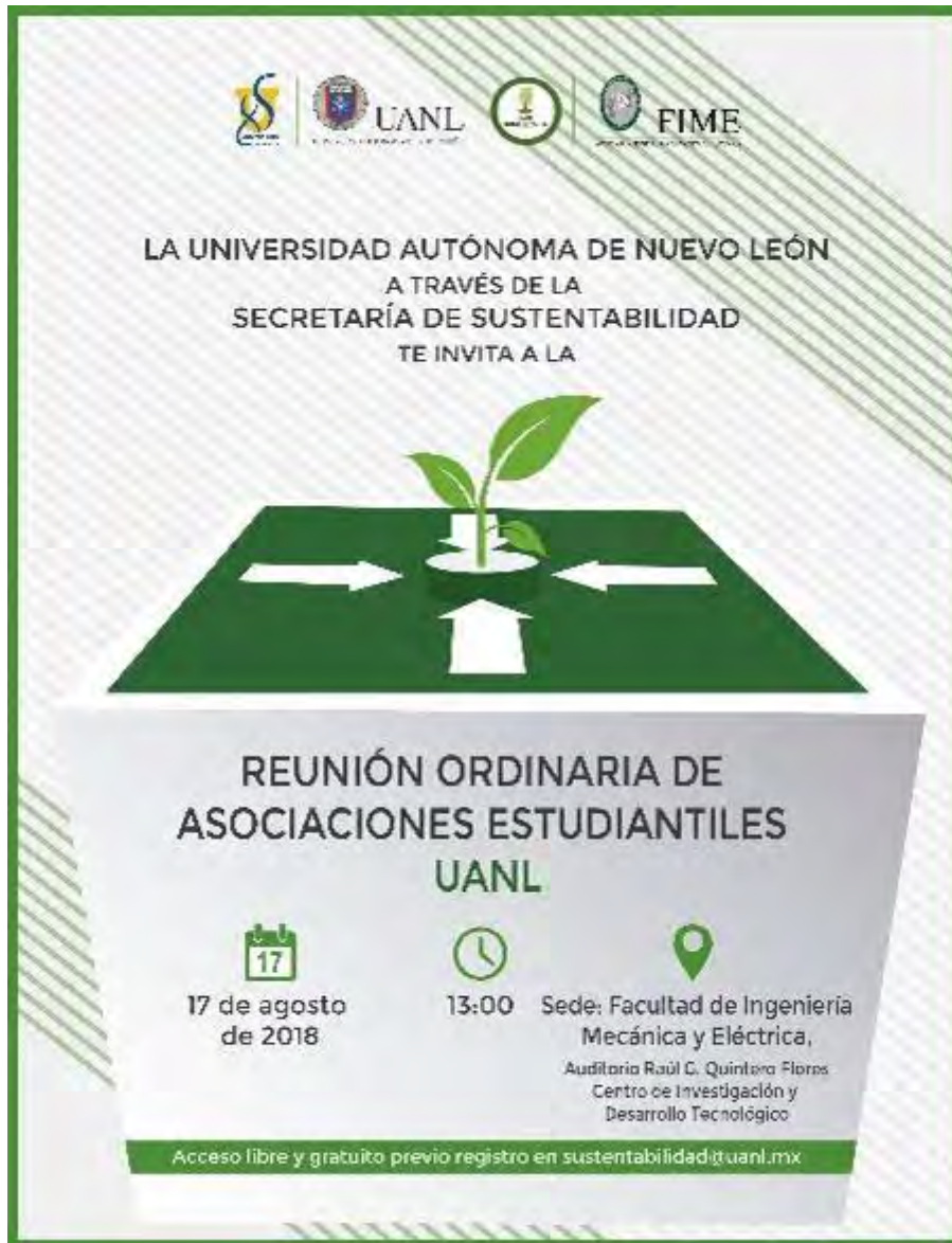
Figure 4. Publicity for an internal students forum in Sustainability at the UANL.

PBL courses don't have the responsibility or the objective of solving real world problems. Problems are greatly motivating excuses, fertile ground for knowledge and skills to grow from confronting them. However, when contextual learning is relevant to the students of PBL courses, there is great potential for projects to take a life of their own and transcend the limits of their intended goals.