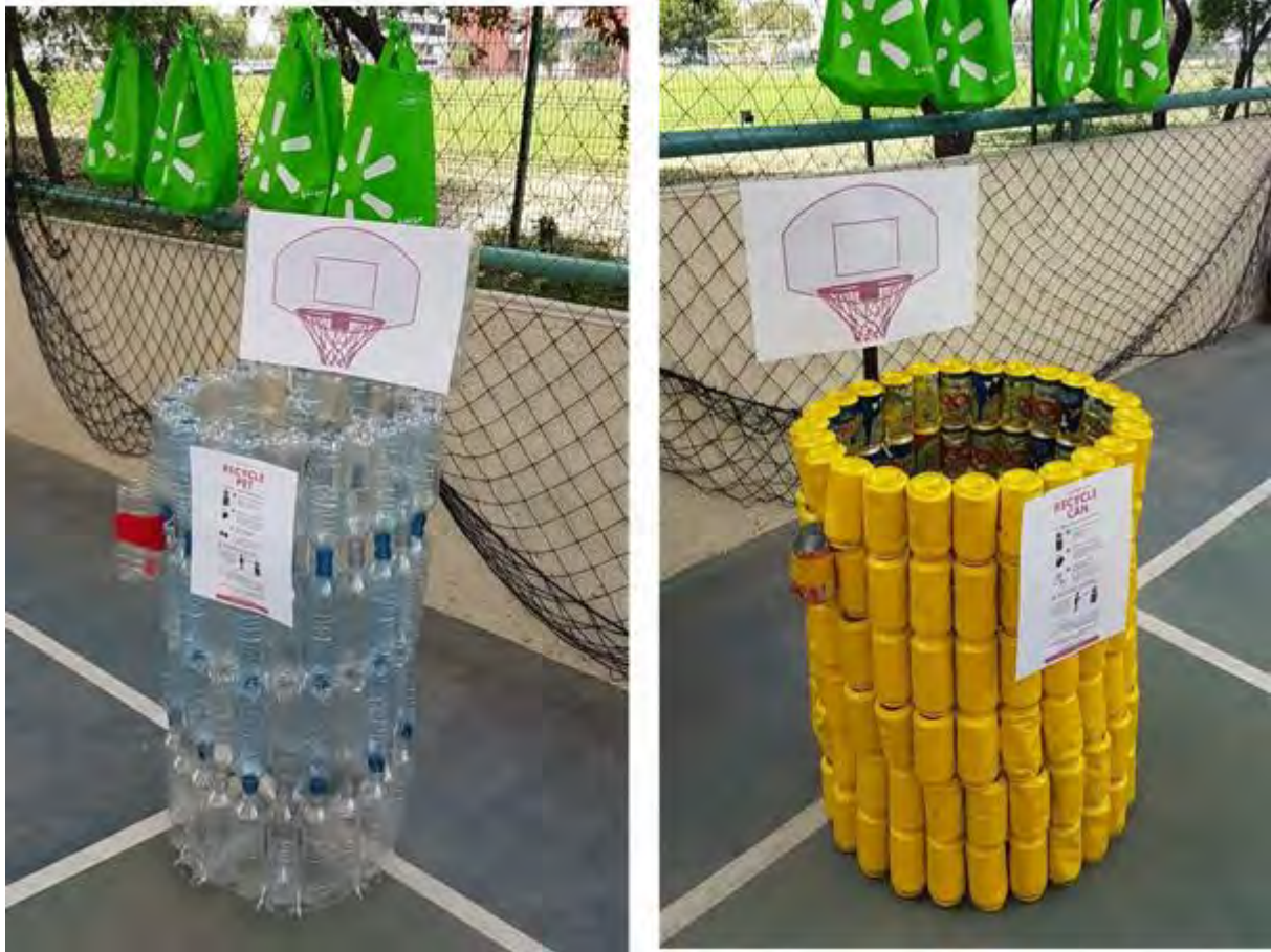
Figure 3. Intuitive pots designed by the students.

Between the 9 th and the 13 th July the group prepared its participation at the previously mentioned event. The students built a brand and they called the team “ Garra Ecológica ” (Ecological Claw), inspired by the university’s sport teams nickname and mascot, Tigers. Also, the team made a sustainable Kit for the participants that includes Tupperware, eco-bags, reusable silverware and Thermos. On Friday 13 th the recreational activities and the sustainability campaign started at the Faculty of Public Health and Nutrition.