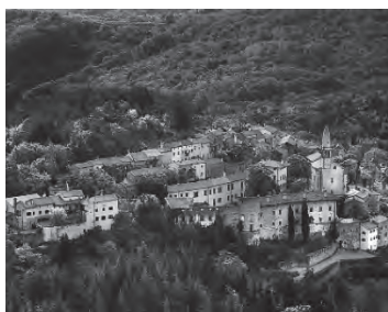
Picture 4: Preservation of architecture in the Slovenian countryside, which is protected as a cultural monument (Deu, 2004, 2009).