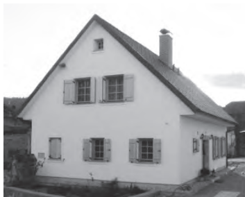
Picture 3: Intervention in architectural heritage (Deu, 2004, 2009).