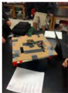
Safety robot with varied alerts for emergency procedures