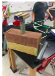
Counseling robot accompanies students who need to leave class