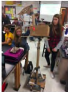
Safety robots (3) designed to help students with disabilities to evacuate during emergencies