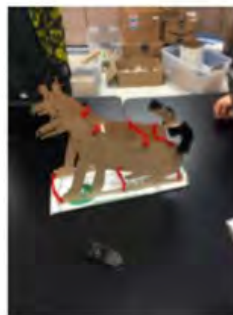
Safety robot with live video feed during lockdown procedures