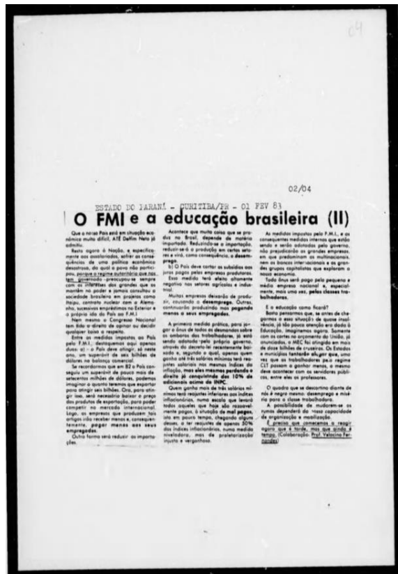
Figure 5: First article written in January of 1983. 26