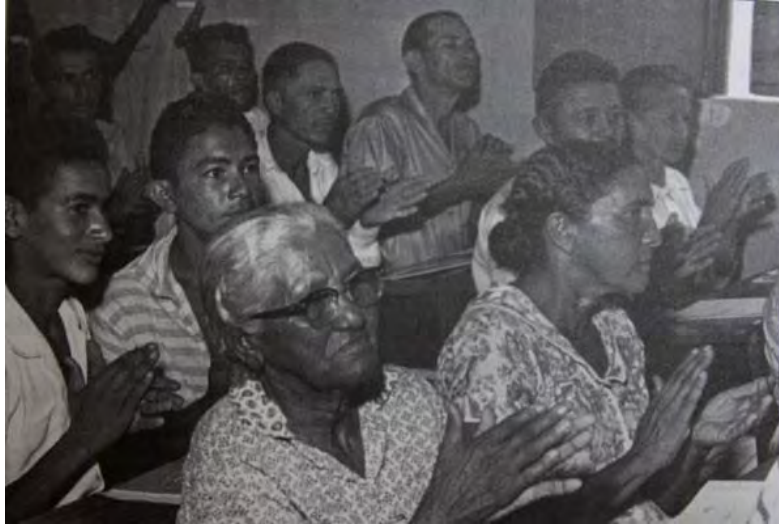
Figure 1: Angicos, rural area in Northeast Brazil, the first classroom in which Paulo Freire used his teaching method. 20

The military had no interest in having a population of capable critical thinkers. Their interest was to have students prepared to be part of the working force. As shown in Figure 2 and 2.1, students are in a classroom where they learned facts (on the blackboard: Brasilia is the capital city of Brazil) and from a textbook. According to Beluzo and Toniosso, education conceived in the dictatorial period, which lasted until 1985, was technologist, that is, focused on the training of labor for the job market, the preparation of the individual. 21 With the end of Paulo Freire's literacy program by the military government in 1965 and the persecution he suffered because of his ideas of justice and equality, he had to go into political exile in Chile.