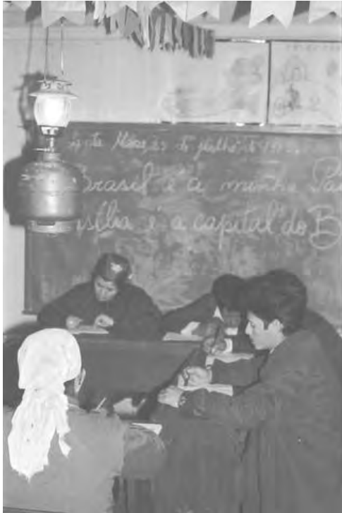
Figure 2: Classroom in Santa Maria, in 1973. 22