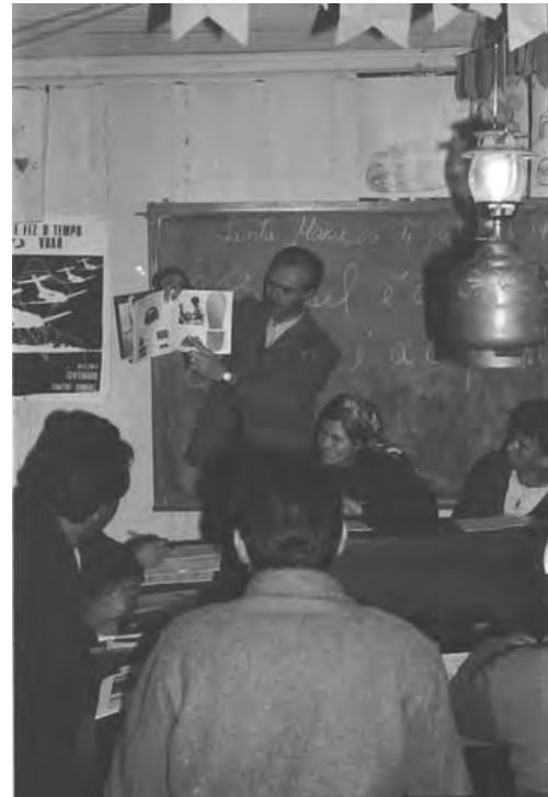
Figure 2.1: Learning from technical books. 23