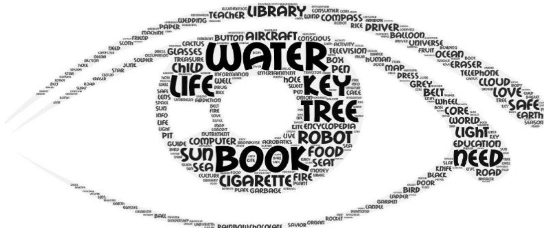
Figure 2. Word Cloud on Metaphors Reached in Research

The metaphors of the prospective teachers regarding digital literacy skills are given in Figure 2. As indicated in Figure 2, the metaphors that teacher candidates emphasize are seen more prominently in large fonts.