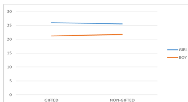
Figure 1. Averages drawing development of gifted and children of normal development by gender