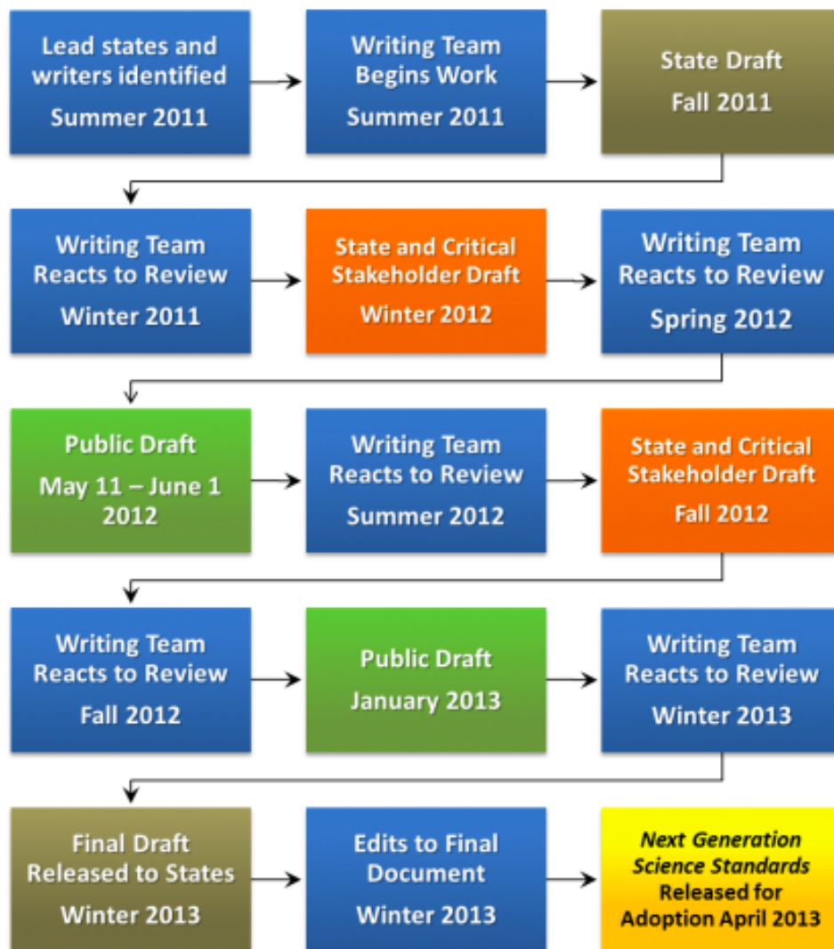
Figure 1: Visual representation of the second stage of the NGSS completion process (NGSS Lead States, 2013).

The Next Generation Science Standards is the result of collaborative inquiry and a structured, deliberate process supported by the National Research Council of the National Academy of the Sciences (NRC), National Science Teachers Association (NSTA), American Association for the Advancement of Science (AAAS), and Achieve (Robelen, 2012). Specifically, these groups completed a two-stage process to create these standards. First, the NRC drafted a preliminary framework by identifying science content that every K-12 student should know and grounding potential avenues of academic inquiry in the most up-to-date research (Branch, 2013; NGSS Lead States, 2013).