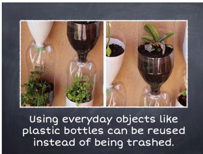
Figure 5. Campers recycled garden design concept presentation