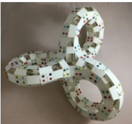
Figure 3. Example of a triple torus structure

The bags they had cut up previously were placed in a convection oven and heated to the processing temperature. The instructor demonstrated how the material was soft and flowable and could be shaped. Each charge of polymer melt was placed in a manual hydraulic press and turned into thick, flat panels. The campers could observe how the printing and colors on the bags remained and moved as the polymer flowed into its new shape. Further, campers could see the thin, flexible bags become rigid and strong sheets when consolidated into thick plates (see Figure 2).