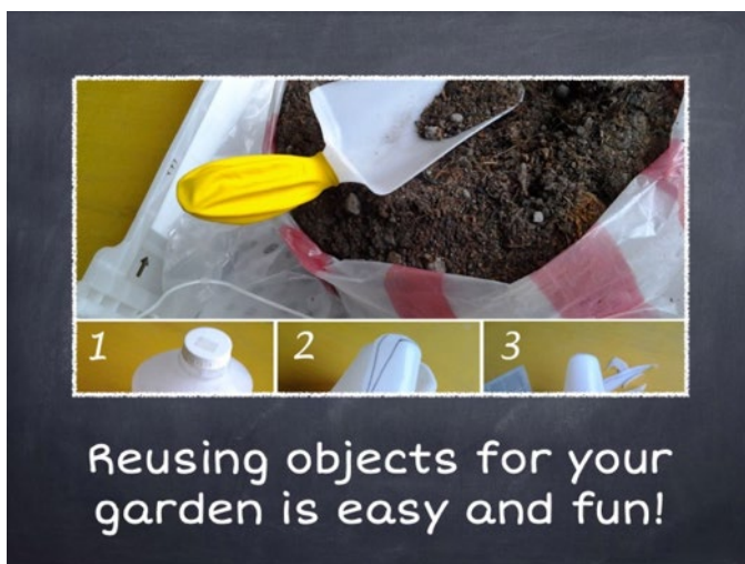
Figure 6. The fun factor of the recycled garden design concept presentation