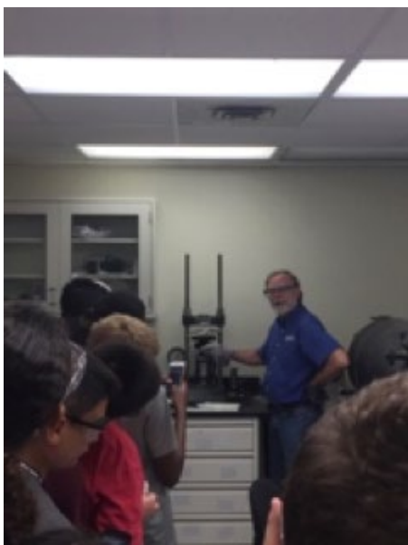
Figure 1. Campers visiting the polymer recycling lab