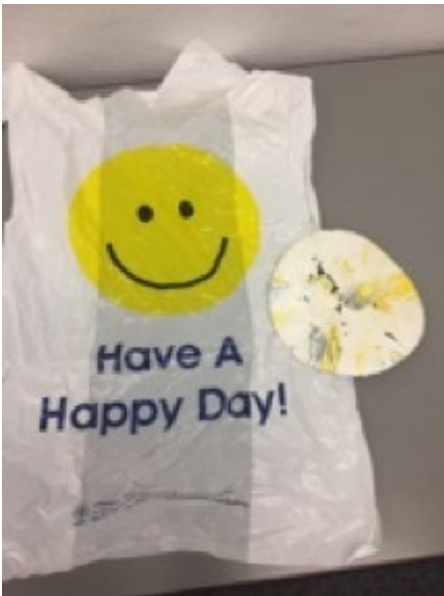
Figure 2. Plastic bag before and after