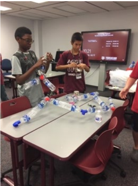
Figure 4. Campers using connectors and bottles to design a 3D shape

class. On the fifth and last day, campers presented a mock sales presentation to a group of hypothetical investors comprised of their peers and instructors. These investors could choose to fund or invest in the campers' product, which the campers could make in the future from recycled plastic filament.