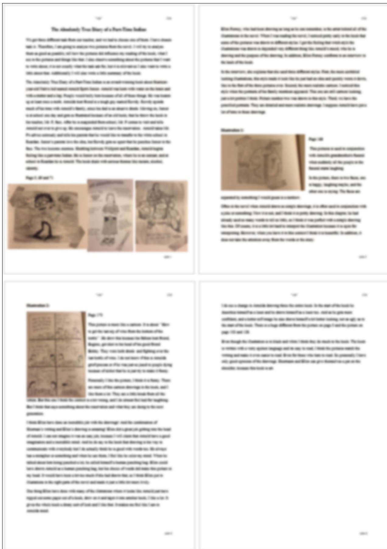
Figure 2: Facsimile of Ida's text.