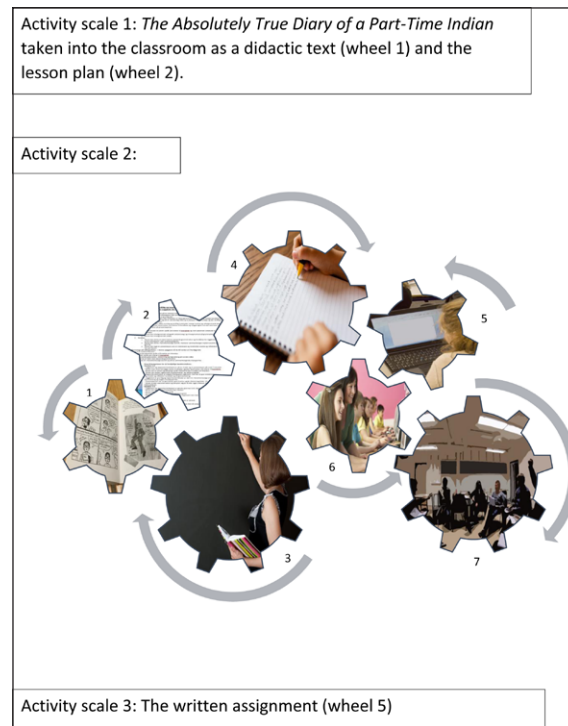
Figure 1: Cogwheel model of the sequence of literacy events designed for reading the novel (adapted from Jakobsen, 2016). The numbers are explained in the main text.

visible when she organizes the subject conversation as a circle in the middle of the room. Normally, and across subjects, the students are seated in rows, with individual desks facing the teacher's desk at the front. Diana specifically uses spatial organization to help overcome some of the affective filters of the students and to create a more engaging atmosphere: