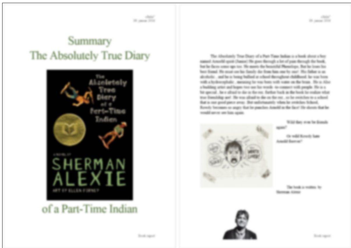
Figure 4: Facsimile of Julie's text.