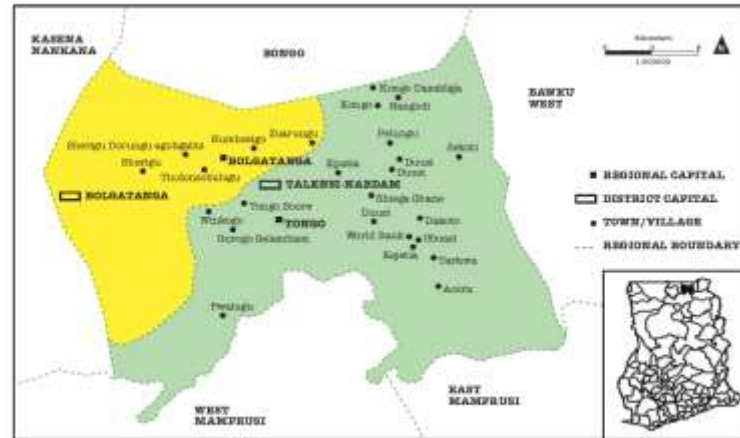
Figure 1. Map of tested area (Bolgatanga and Talensi Nabdam Districts).

al. (2007) and Stringer and Reed (2007) key steps should be taken in the assessment of human caused environmental problems through research into the scientific and social determinants and the adoption of an appropriate environmental assessment procedure.