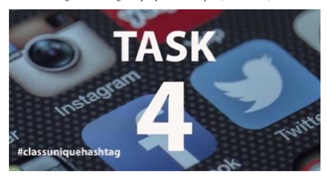
Figure 2. Branding Example - Question Number Graphic (Used in pilot assignment)