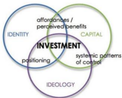
Figure 1. Model of Investment (Darvin & Norton, 2015)

Enlightened from this model, when learners move across communities, the value of their economic, cultural or social capital also shifts across time and space. It is also normal for their ideologies to collude and compete. Their identities and self-positioning are hence shaped in different ways. Learners' symbolic capital (i.e., linguistic or cultural capital)—including their prior knowledge, home literacies, and mother tongues—influence their investment in the language learning practices. The investment is dependent on learners' perception of affordances or benefits for the self, or the action possibilities perceived by the learners.