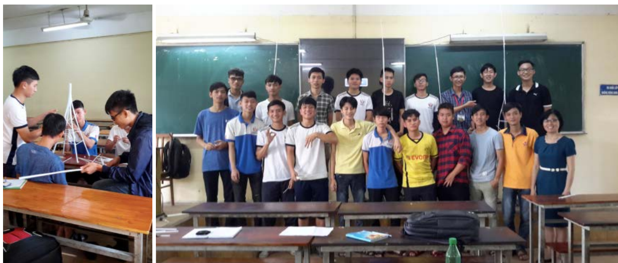
Figure 3. Build a tower from 200 straws and scotch tapes