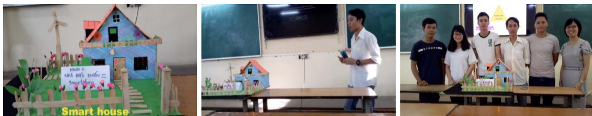
Figure 2. The smart house developed by recycling waste materials

Observing the performance of students and based on rubrics of problem solving and teamwork indicated that the total score of rubrics of students achieved the “exceeds expectations” level.