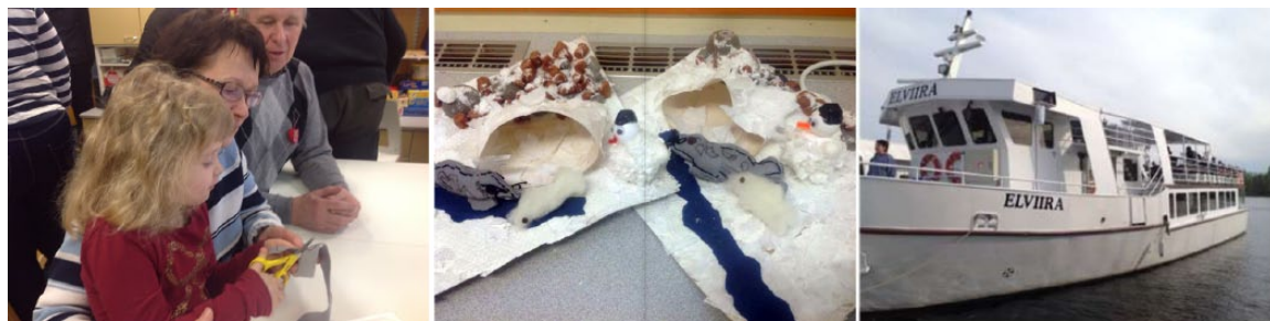
FIGURE 9. Connecting with family (Preschool group's Saimaa ringed seal project).

interest as a deepening inquiry learning project because there were only a few words and questions. One preschool teacher also said it was challenging to capture the children's interest through joint discussions. The primary-school teachers explained their students' interests through heterogeneity: "Those pupils who aren't usually very interested in going to school or who suffer from learning disabilities also participated with enthusiasm during the whole project."