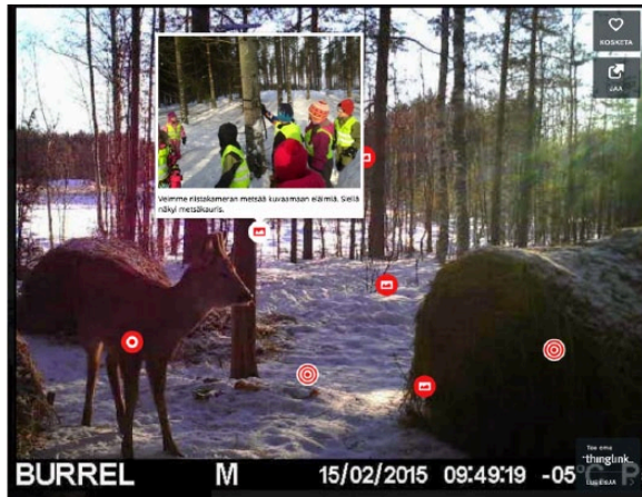
FIGURE 7. Collecting data from real objects ( Observing the life of the forest with trail cameras project, preschool group ).