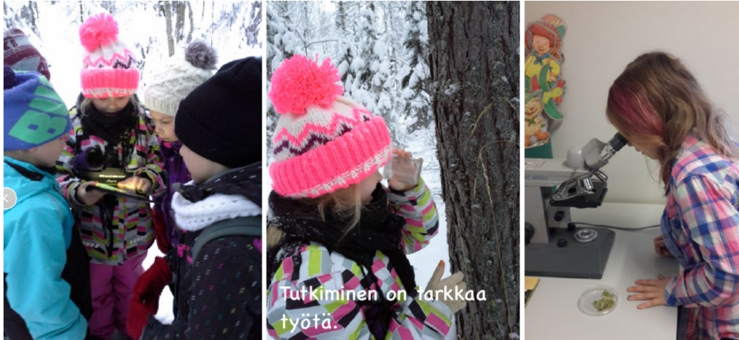
FIGURE 4. Tool-mediated data collection (Let's go into the woods project, primary-school group).

in the following example reported by the teacher of the group of 3–5 year-olds: “Children’s reasoning on how we could find out which animals are living in our neighboring forest: by observing in the forest—from books—by asking the teacher—from TV—daddy can tell us—my grandpa knows; he hunts.” She continued by exemplifying how the kindergarten teachers used the children’s ideas to design the future activities: “On the whole, we have spent time in the woods doing every possible form of action; this means that the forest and animals were the driving forces in the group’s activities.”