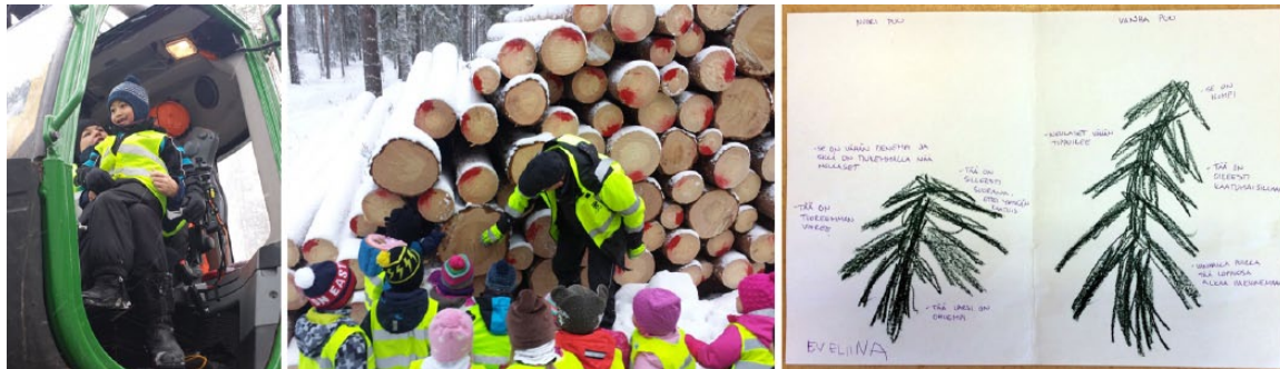
FIGURE 6. Observing real objects with an expert (Expedition to the forest project, group of children, 3–5 years).

Collecting Data With Experts and With Expert Tools. The observation of real objects was also supported by expert communities. For example, two kindergarten groups went to a museum, and six went to a library. The toddlers’ kindergarten teacher explained how they harnessed the children’s observations of the natural world (rabbit tracks) to practice an information search with an external expert.