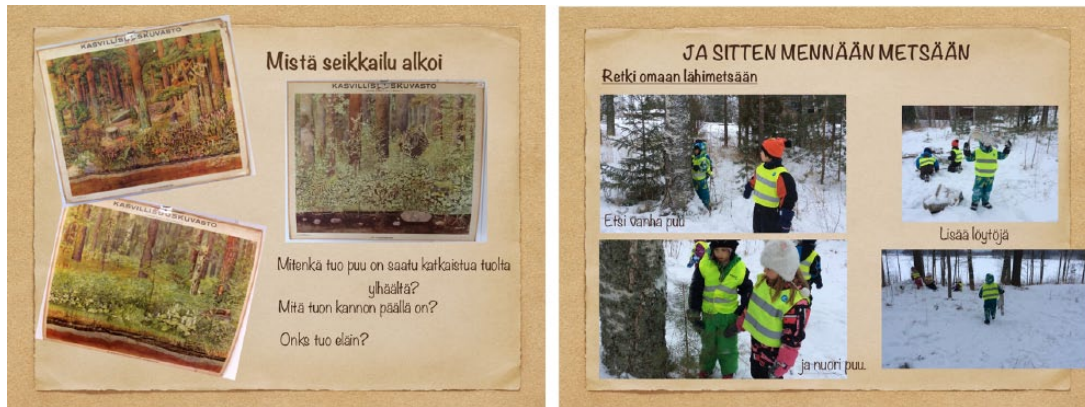
FIGURE 3. Developing interest and questions (Expedition to the forest project, group of children, 3–5 years).

was made visible through various materials and bodily activities. Finally, we examine teachers' reflections about the process of facilitating children's participation and learning.