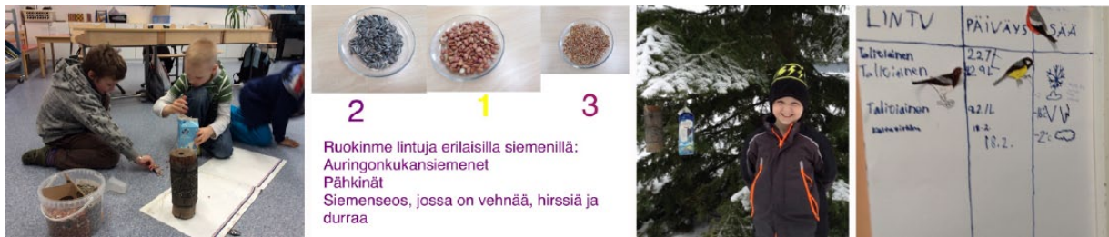
2 1 3 Ruokimme lintuja erilaisilla siemenillä: Auringonkukansiemenet Pähkinät Siemenseos, jossa on vehnää, hirssiä ja durraa