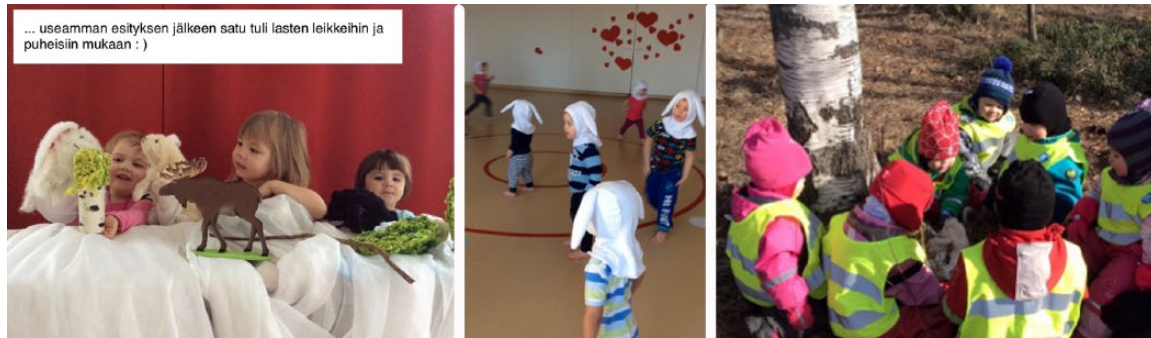
FIGURE 8. Inquiring objects through bodily activities (Life of a bunny project, group of 1–3-year-olds).