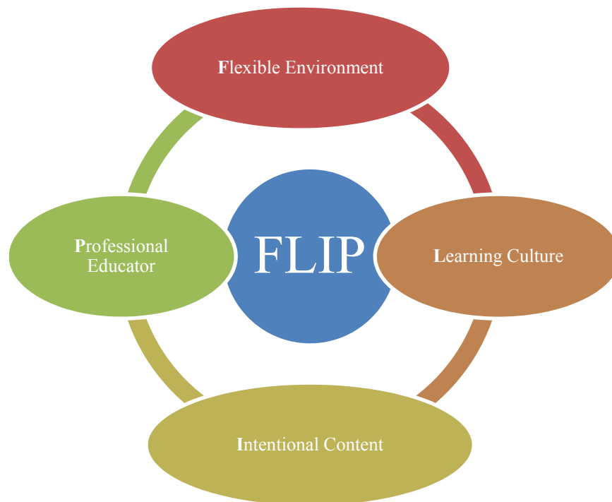
Figure 1. The Four Pillars of the Flipped Learning (FLN, 2014)

By FLN (2014) standards, for a class to be considered “flipped” it must have four basic pillars (Figure 1): (1) a flexible environment in which students choose when and where they learn, (2) a learning culture where student-centered model is applied, (3) an intentional content used by educators to maximize classroom time in order to adopt methods of student-centered, active learning strategies, depending on grade level and subject matter and (4) a professional educator who takes on less visibly prominent roles in a flipped classroom and remains as the essential ingredient that enables flipped learning to occur.