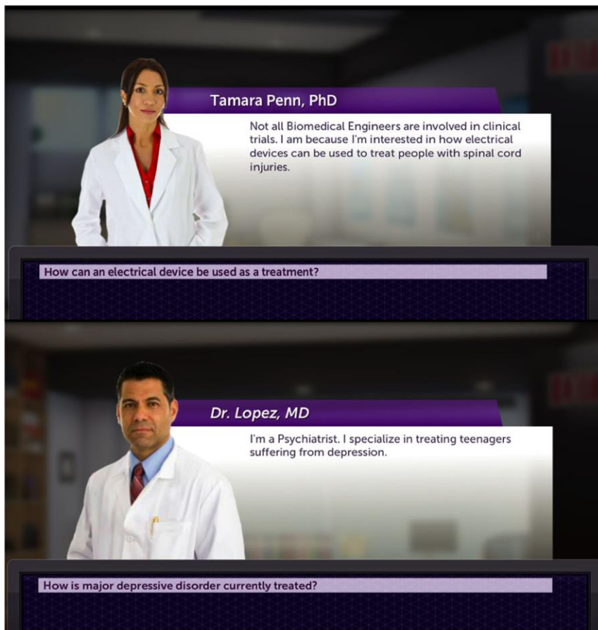
Figure 2. Screen capture from Trial 1: Spinal Cord Injury (top image) and Trial 2: Teen and Depression (bottom image) showing dialogue with the biomedical engineer and psychiatrist.

Three published clinical research studies were used as models to develop the simulations (Dixon et al., 1999; Emslie et al., 2002; Popovic et al., 2006). A storyline with a problem to be solved was embedded to add structure to educational content and create a situated learning context. In Trial 1: Spinal Cord Injury , players are given the goal of helping clinical trial experts set up a Phase 2 trial testing an electrical device for treating patients with spinal cord injury. The simulation involves a biomedical engineer, a clinical trials coordinator and a clinical trials director. In Trial 2: Teens and Depression , the player designs a phase 3 clinical trial testing a new antidepressant for treating teenagers with major depressive disorder. Characters in this simulation are a psychiatrist, a clinical trials coordinator and a clinical trials director. The third simulation involves the preclinical laboratory testing of two new drugs for treating traumatic brain injury in rats. The two careers portrayed are a neurobiologist and a clinical trials director. Since the third simulation involves the preclinical laboratory testing in rats rather than humans, it was not included in this study. In each simulation, the player is placed in the role of designing the trial, with the guidance of other characters that are modeling their specific career (Figure 2).