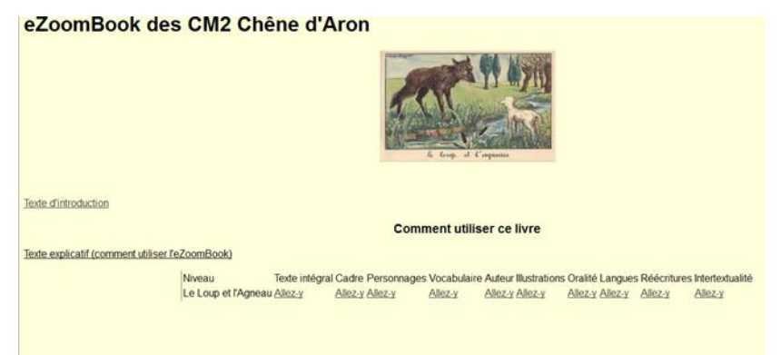
Figure 1. Table of Content of the Fable eZB

work. When assembling the production, the different layers were defined, and arranged so that they presented themselves as tabs that also served as a table of contents.