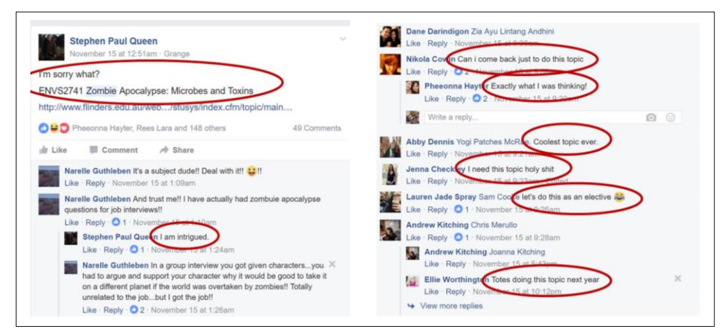
Figure 2 . Comments posted about ENVS: 2741 Zombie Apocalypse: Microbes and Toxins on the "Overheard at Flinders University" Facebook page