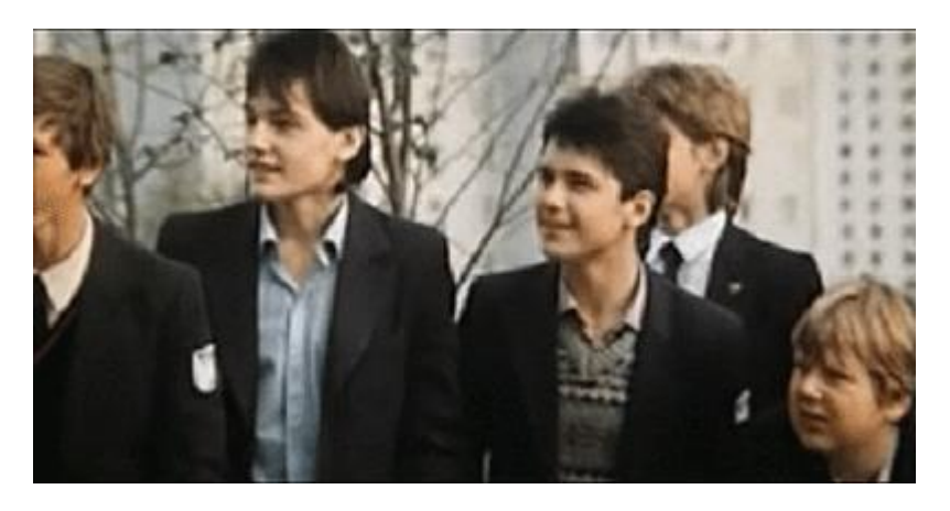
Fig. 1. A frame from the film Non Slap in the face (1987)

A frame from the film Non Slap in the face (1987) gives an idea of the appearance, clothes, physique of the characters – students of the era of "perestroika".