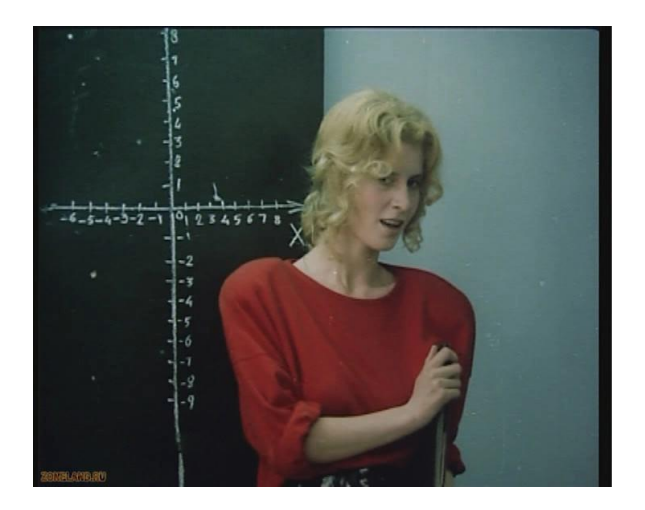
Fig. 2. The frame from the film The Doll (1988)

A shot from the movie The Doll (1988) reflects the appearance, clothing, physique of the character-teacher of "perestroika" years.