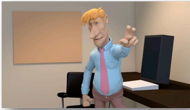
Figure 2. Animated character of people in video

Animated character: Instructional videos may make learners boredom if the actual people were used in the whole period of the video. Hence, in order to make an effective video, we can get the animated character of the involved people. The advantage of this approach is the instant engagement of learners with the learning content, along with having fun while learning (Kapoor, 2015).