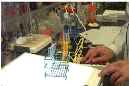
FIGURE 1. Monitoring a color change in a chemical reaction using the SALS and a light box.

photocell that measures light intensity changes. The photocell is encased in a transparent “wand” that is small enough to allow measurements to be made in ordinary test tubes or beakers. The test tube or beaker is placed over a light box or a white reflective surface such as a piece of printer paper, as illustrated in Figure 1. As a reaction proceeds, the varying light intensity at the tip of the sensor wand is converted electronically to an audible tone. The chemical change (e.g., how cloudy or dark the solution becomes) is indicated by a more pronounced change in pitch, usually from high to low. The SALS control box has a memory function that allows reference and data pitches to be stored. It can output these pitches directly or as spoken frequency values.