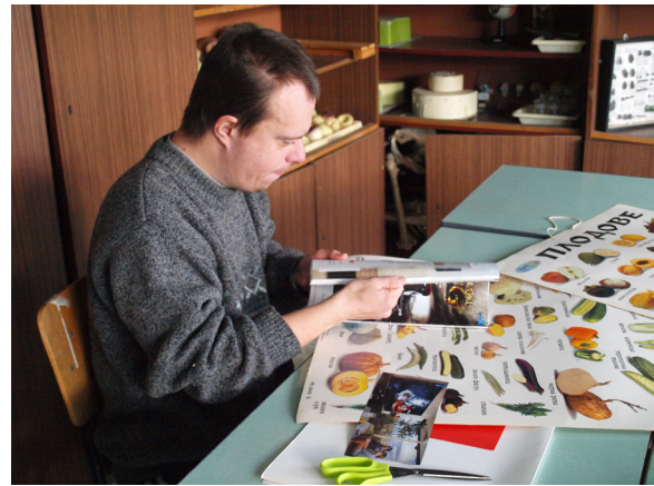
Figure 3: A moment in performing an activity “In what way can energy resources be utilized?” (find a picture of a favorite food in a magazine).