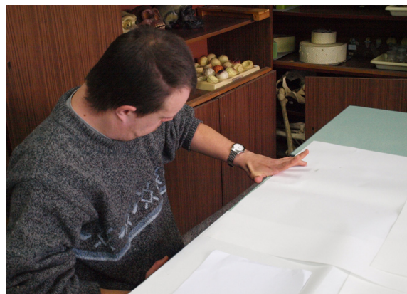
Figure 1: A moment in performing an activity "How can matter be measured" (estimate the length in "hands")

compare this figure to the one in meters and record their opinion of the relationship between the two (Elaborate).