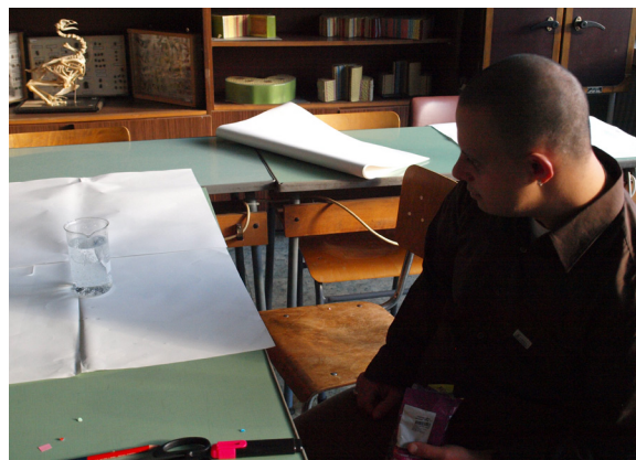
Figure 8: A moment in performing an activity “Raisins in a carbonated beverage”

The correct answer is “D”. The raisins will initially sink, but then the bubbles will force them up to the surface (Explain and Elaborate). The process is repetitious (Figure 8).