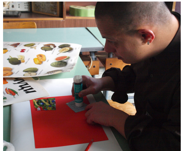
Figure 4: A moment in performing an activity “In what way can energy resources be utilized?”

Upon reviewing the stages, request the elimination of the unnecessary ones or the substitution of the inefficient ones, to show how much energy can be saved (Explain).