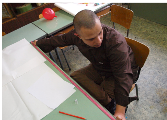
Figure 2: A moment in performing an activity "How can matter be measured" (estimate the length in centimeters)