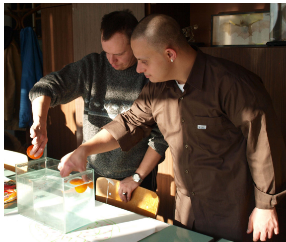
Figure 5: A moment in performing an activity "Swimming tangerines" (submerge a tangerine in water)

Ask the students to submerge a tangerine in water (Engage and Explore). It will float in the liquid (Figure 5).