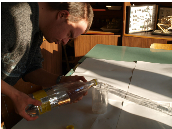
Figure 7: A moment in performing an activity “Raisins in a carbonated beverage”(drop a few raisins in a carbonated soft drink)

Ask students to drop a few raisins in a freshly opened bottle, or a poured glass, of any carbonated soft drink (Figure 7) (Engage and