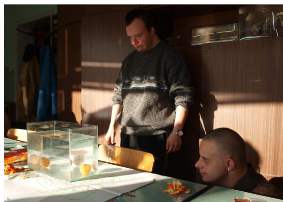
Figure 6: A moment in performing an activity "Swimming tangerines" (submerge a tangerine in water)

Request the learners to peel the tangerine and to submerge it again (Figure 6) (Explore and Explain).