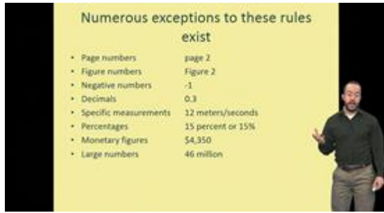
Figure 1. Main video lecture without summaries.