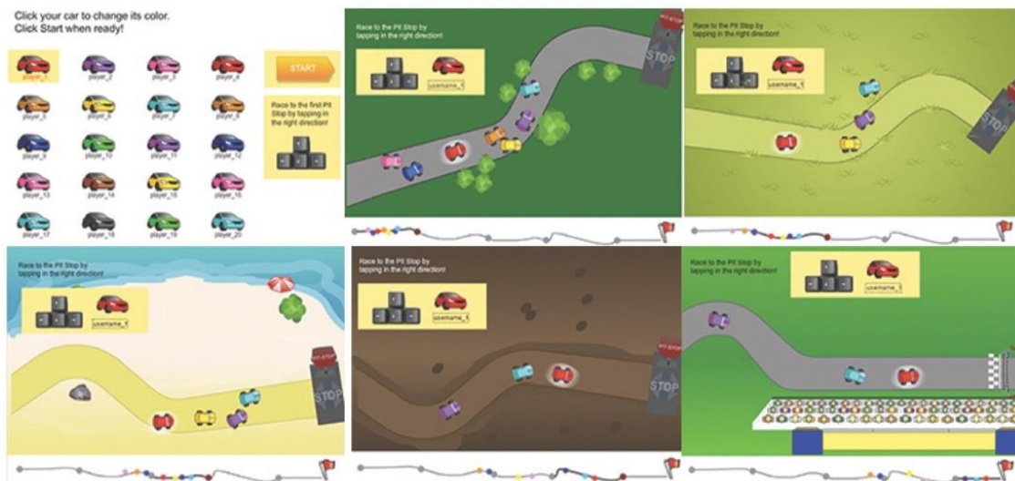
Figure 2. Reason racer staging area and sample racecourses