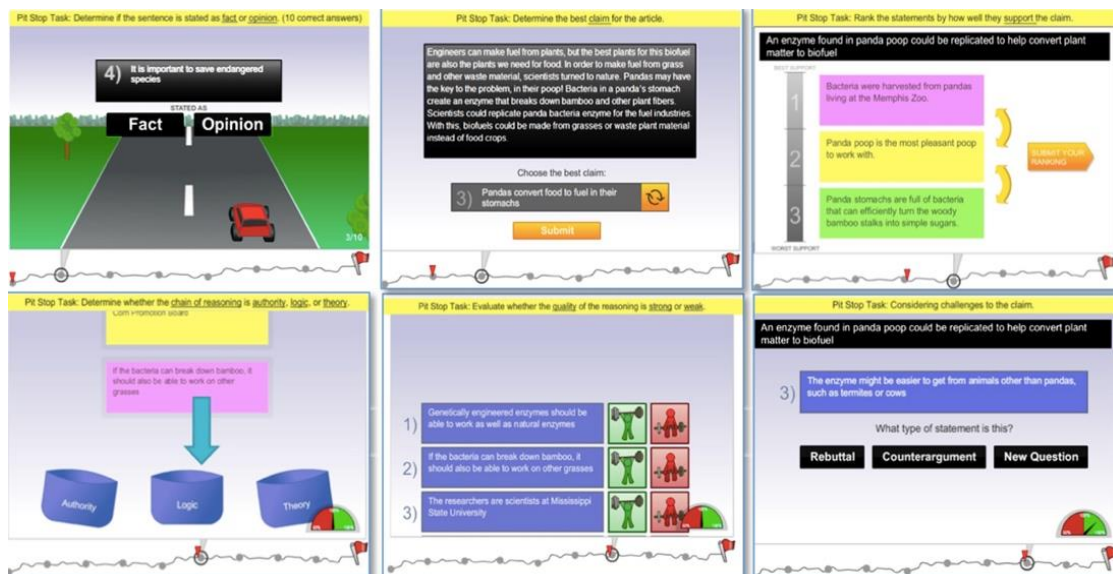
Figure 1. A sample of reason racer pit-stop challenges