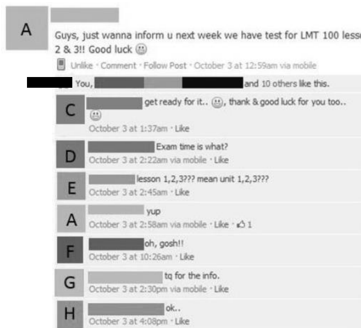
Figure 1. A practical academic information post to inform about a test

Table 2 shows three types of posts shared in the Facebook group. While the moderator shared more academic content, the students gravitated towards socio-academic content. The academic content includes educational and practical academic information, e.g. assignments, lecture notes, class schedules and venues (Figure 1). The non-academic posts include everything else such as students' self-expressions, where Facebook becomes a personal microblog (Lenhart, Purcell, Smith, & Zickuhr, 2010) (Figure 2). The socio-academic posts are social in nature, but relate to the university setting. This includes advertisements or promotions of events and contests conducted at the university (Figure 3). Students also used the group to share their creative productions, and asked the members for likes when they participated in a contest or competition at the university.