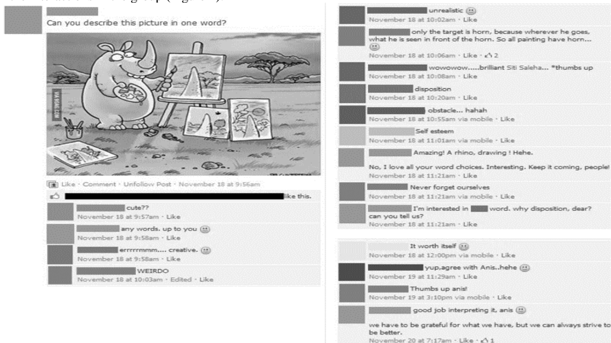
Figure 4. A post to enhance vocabulary acquisition

The interviewees saw the moderator as responsible in ensuring sufficient English language content and materials in the group. Previous findings similarly observed that students often feel demotivated to take charge of discussions, and refuse to let go of facilitators' control in the online environment (Clark, 2000). There were a variety of content shared by the moderator in the forms of reading articles, links to English language activities, grammar quizzes, discussion threads, audio recording, and comprehension exercises. For example, the moderator encouraged vocabulary learning from the interactions in the group (Figure 4).