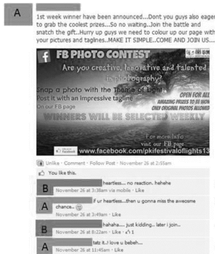
Figure 3. A socio-academic post that promotes a contest at the university

The findings show the different ways that the moderator and the members used the Facebook group. It was also observed that the students' motivation for using the group, shifted, from wanting to learn English language and socialising, to circulating information of the happenings at the university. Following previous literature, the students did not perform much academic activities in the group (Madge et al., 2009; Selwyn, 2009), but their active participation was skewed towards promoting university events. Perhaps, when their needs to learn English language were not met, they lost interest and found other ways to utilise the group.