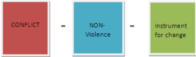
Paradigm of Peace

the reference to human rights. This new concept is referred to as the 'just peace' approach and is built upon three pillars: - An adaptive process and structure of human relationships characterized by high justice and low violence - A societal infrastructure that actively responds to conflict by nonviolent means as first and last resorts - A system that allows for permanency and interdependence of relationships and change (Lederach).