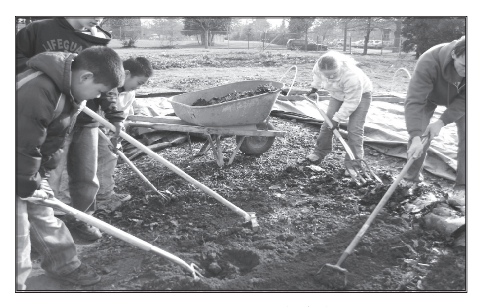
Figure 3. Preparing garden beds

The data confirm the importance of peer and social relationships. Place memories were strengthened through activities with peers (see Figure 3). Truc summed it up best, saying: "I will remember the people that I worked with, how we got along." In their photo-voice, Mei shared: "I feel peace. I see friendship. I see that we can help harvest and love," and similarly Lidiya stated: "I am making new friends."