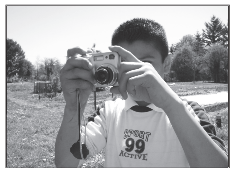
Figure 2. Student taking photograph

they planted carrots and radish seeds with Kim (from Vietnam) joining them. They agreed to add sorrel, since Lidiya shared, "we also grow this at home in Ukraine."