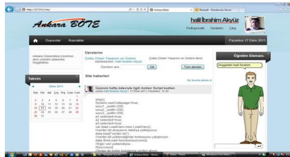
Figure 1. Education agent in teacher role supported by speech bubble

Figure 2 presents the salutation screen of the educational agent in teacher role, not supported by speech bubble. In this page, an educational agent in teacher role presents a salutation message by voice only.