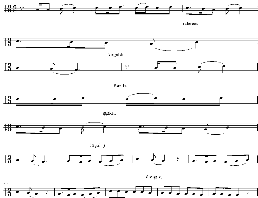
Figure 4. notes of Bir Gül Ektim Duvara

Temporary stays, Rhythm is 6/8 Yürük Semai. In the first measure, Buselik trio on La pitch, in the second measure, Nevada natural temporary stays, in the third and fourth measures Buselik trio on La pitch, fifth measure, Çargah trio on Acem Aşiran, in the sixth measure, Buselik trio on La pitch, in the seventh measure, natural temporary stays on Neva pitch, in eighth measure, Buselik trio on La pitch, in the ninth measure, Çargah tetrachord on Rast, in the tenth and eleventh measures, Çargah trio on Acem Aşiran, in twelfth on measure Çargah trio on Rast, in the thirteenth measure, Çargah trio on Acem Aşiran, in fourteenth measure Çargah trio on Rast in fifteenth measure Çargah three on Acem Aşiran, in sixteenth measure, Çargah tetrachord in Rast, in seventeenth measure, Çargah trio in Acem Aşiran, in eighteen measure, natural temporary stays on Acem Aşiran. Characteristic of melodic cruise is in harmonious with Rast mode for its decision and temporary stays.