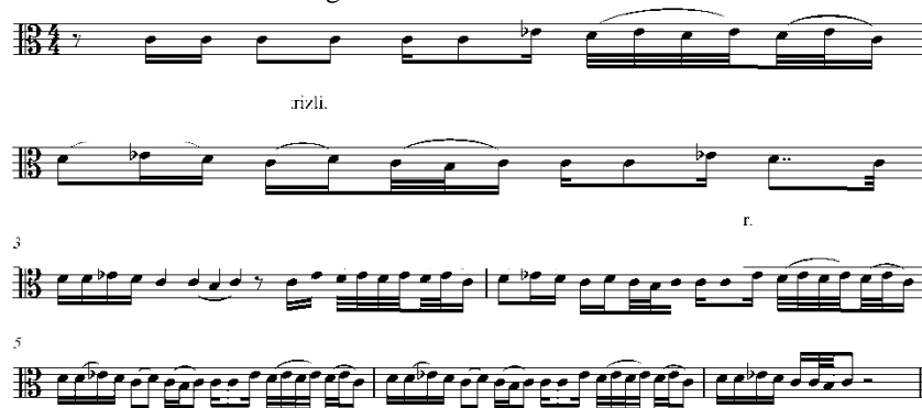
Figure 2. Notes of folk song Aya Bak Nice Gider