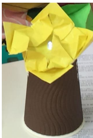
Figure 2: STEM Makerspace pilot artefact.