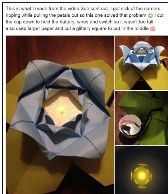
Figure 4: Facebook posting.