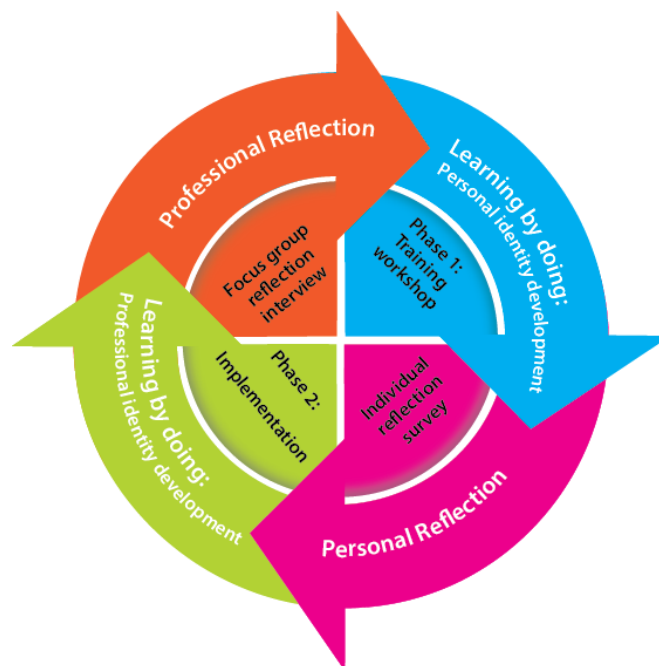
Figure 1: Reflective Identity Formation Model (Sheffield & Blackley, 2016).

Phase 1 of the model focussed upon the PSTs’ personal identity as a STEM-consumer as they were expected to learn how the components of the artefact interacted to result in an operational product. Over the course of a two-hour workshop, the PSTs in collaboration with the engineering student engaged with a socio-constructivist approach (“learning by doing”) to construct an origami flower and then create a circuit that would allow an LED bulb to illuminate the centre of the flower (Figure 2). The members of the research team facilitated the session by grouping pre-service teachers (PSTs) and the engineering student to enable them to: