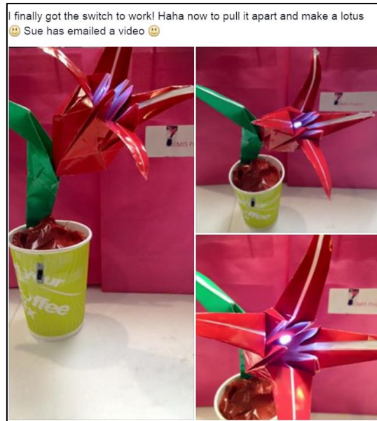
Figure 3: Facebook posting