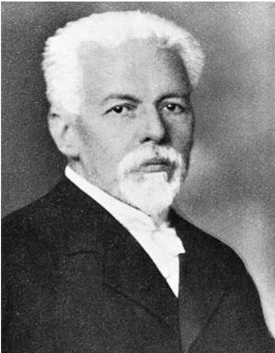
Fig. 1. Georg Kershenshteyner

He said about big delusion that civil education and civic education same. «If so to judge, then the best citizen the one who studied the greatest number of political sciences. It is also wrong qualification what is applied at our schools at exposure of the highest marks under the God's Law to those pupils who it is better than others learned by heart the Bible and the Catechism» (Kershenshteyner, 1917: 11). So far ways of teaching religious and ethical sciences which averted pupils from religion and moral, according to the author, existed at national schools. This danger always arose at the compulsoriness in training which is not stopping only on assimilation and multiplication of knowledge. It became inevitable when compulsoriness extended and on assimilation of ethical knowledge.