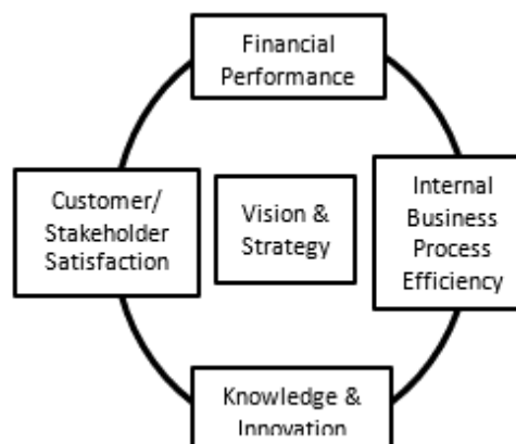
Figure 1 – Kaplan & Norton's Balanced Scorecard

Numerous commercial organizations have applied this model for years to improve their operations. An increasing number of non-for-profits have started applying Kaplan and Norton's model as well. In the next section, the author examines the research that has been conducted on applying the Balanced Scorecard model to higher education.