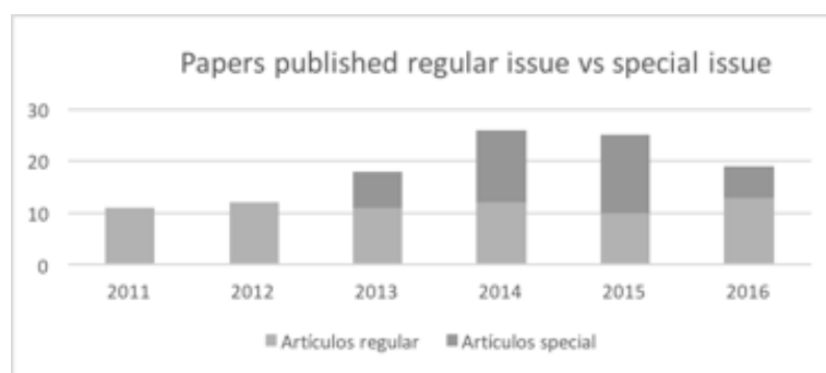
Figure 1. JOTSE's evolution

When analyzing JOTSE's evolution (See Figure 1) we can observe that the objective of steady growth has been accomplished throughout these 6 last years.