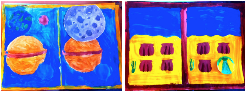
Pictures 2 and 3. Paintings by fifth-grade students from Slovenia, 2014/2015 school year.