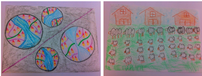
Pictures 4 and 5. Paintings by fifth-grade students from Slovenia, 2014/2015 school year.