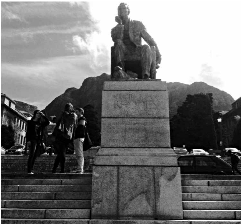
Power and internalised inferiority (Sean)

The following photo-story about the statue of British mining magnate and colonialist Cecil John Rhodes (who ‘donated’ the piece of land on which UCT is built) that previously stood high in the centre of upper campus 8 captures many of these ideas.