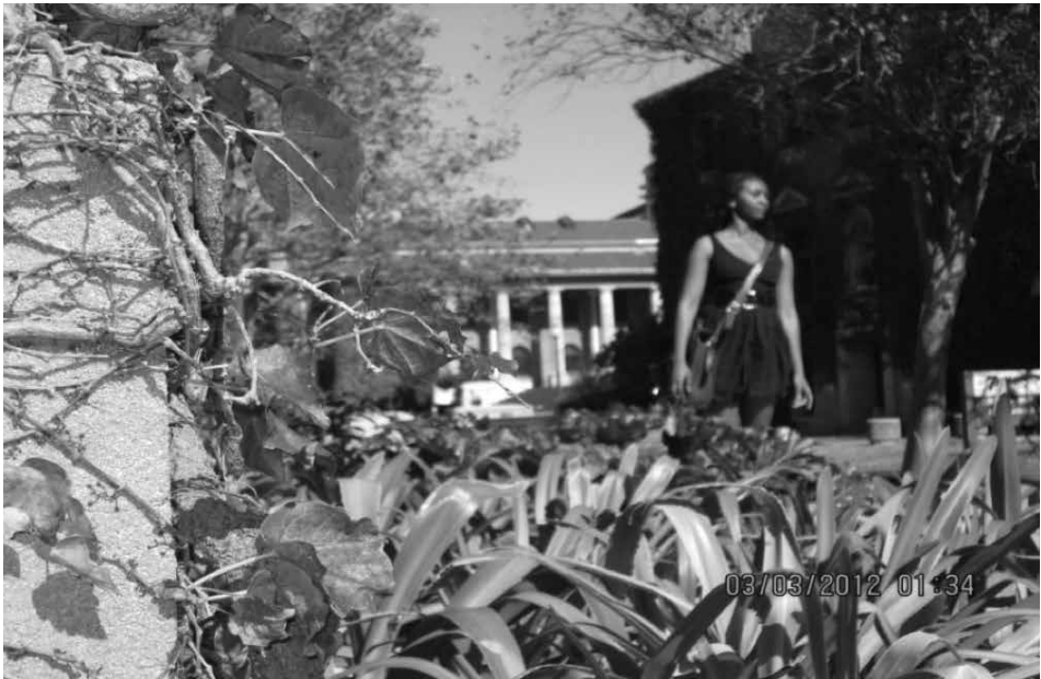
Out of focus

In this first photo-story, Claudia describes her impression of UCT as more concerned with its reputation than with embracing the racial transformation of the institution. In the photograph, a black student is standing 'out of focus' in front of a UCT building that is 'in focus'.