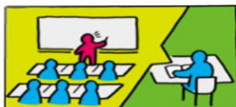
The traditional model