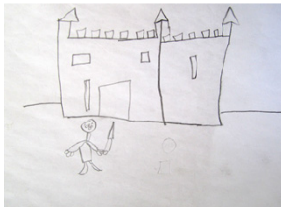
Figure 4. The story of the soldier and the castle

Once upon a time, a woman and a piping man became familiar and married each other and after their marriage, they were searching a house. The houses were expensive. The man thought with himself that I buy a house from my father-in-law and then kill the bride. The groom hadn't money. The bride's father was forced to borrow two hundred million for him to buy a house. Then they got married. The groom said to the bride: come to the room I want to say a private thing to you. He took the bride into the room and killed her by a sharp knife and then he cried and said: I didn't want to do this. I was forced. The next day, he sold the house and escaped and went to the airport and he was arrested there.