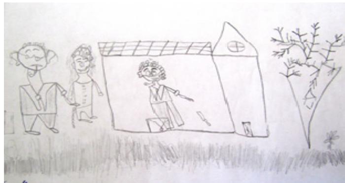
Figure 3. Not to forgive and killing the bride woman

A mouse did an ill turn to the other one and struggle with each other and this mouse stabs his dagger at the back of the other mouse. The mouse cries a lot and the other laughs and says that this is the respond of the evils you did to me in front of our house.