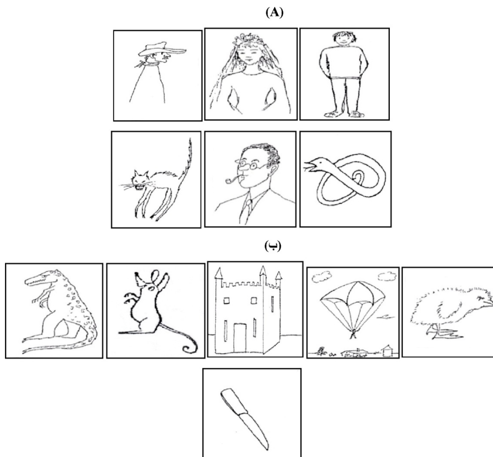
Figure 1. Motion pictures in drawing a story

Silver recommended the DAS test in order to evaluate and distinguish the overt, withdrawal and depressed aggressive children (Silver, 1989, 2005). The validity and reliability of DAS on a group of aggressive children have been considered and reported in Iran (Shahim & Razmjuee, 1388; Chamandar, Shahim, Mazidi, & Seif, 1391).