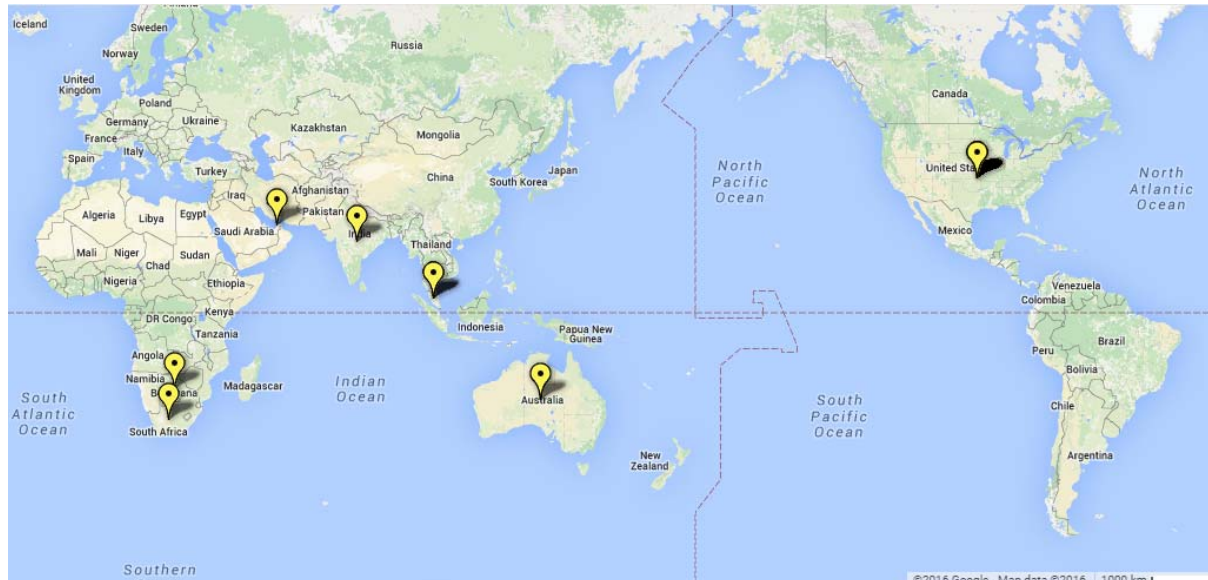
Figure 1: Geographical distribution of the 13 articles