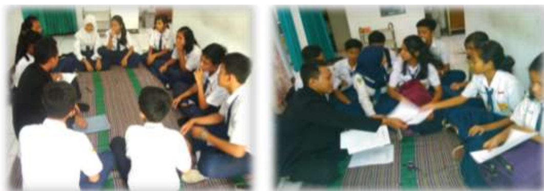
Figure 2. Process group guidance service model with self-regulation techniques to improve student motivation junior high school.