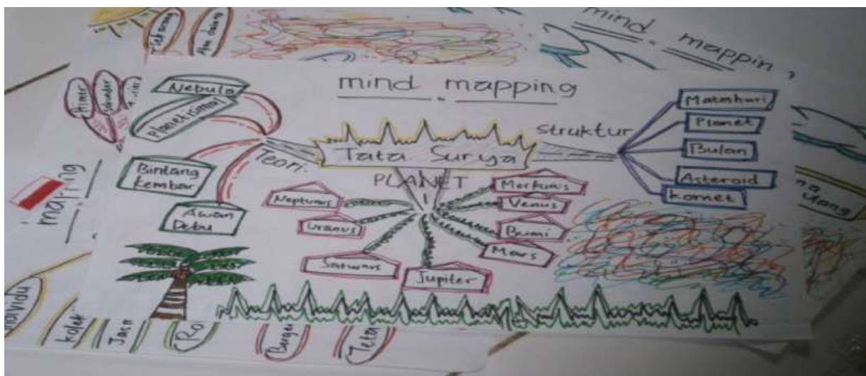
Figure 3. Students create concept maps in learning.