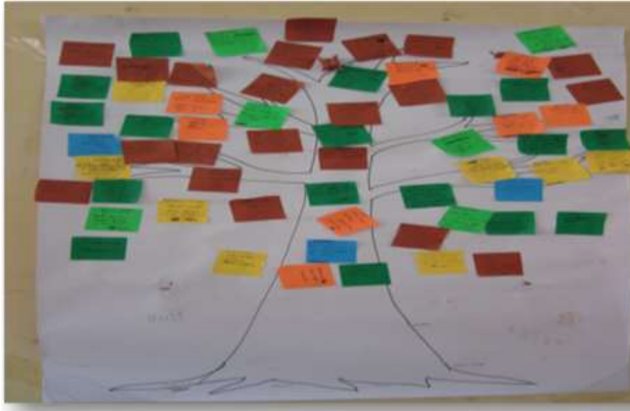
Figure 4. Students make planning and study schedule in the form of learning tree.

Experienced researchers as a group leader in the activities of group counseling by utilizing the techniques of self-regulation to improve students' motivation, it was found that the procedures for implementing the service increase student motivation with the model group guidance through the techniques of self-regulation provide equal opportunities to each group to get involved and active during the activity. Starting from the establishment phase to the termination stage.