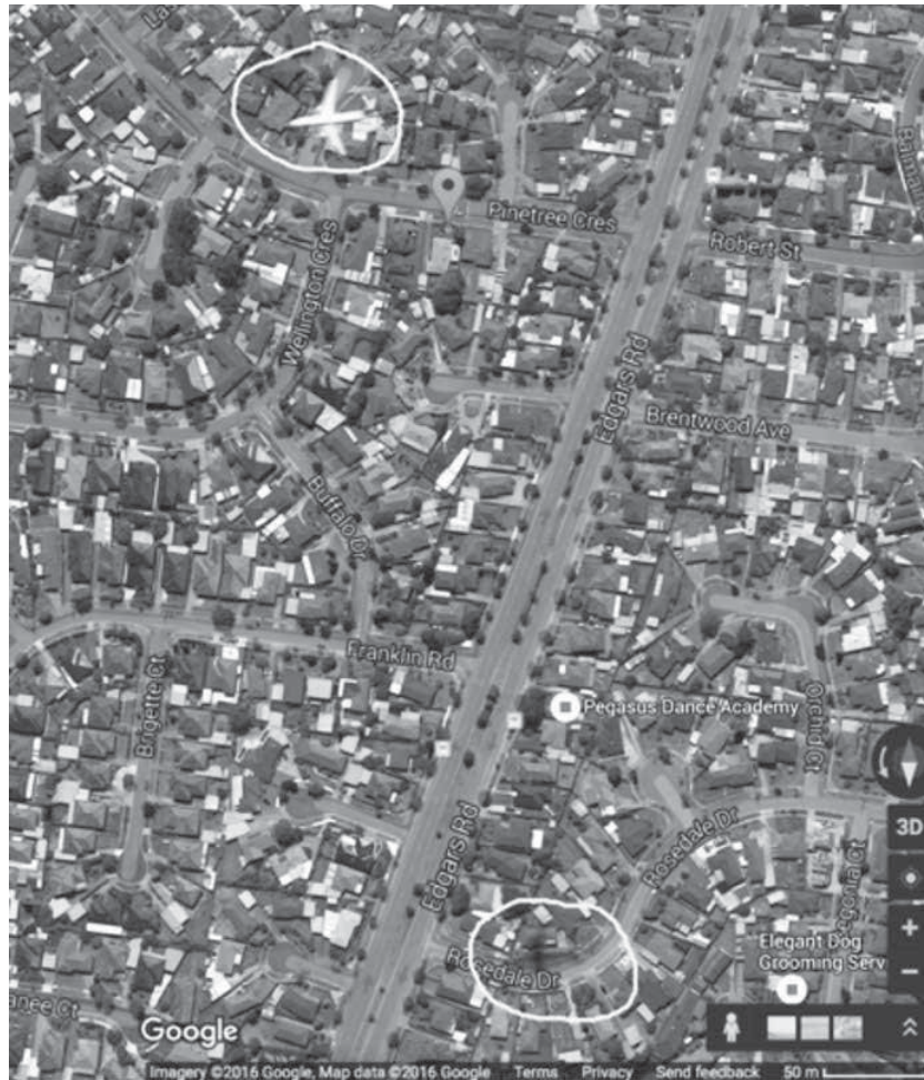
Figure 2: The plane and its shadow.