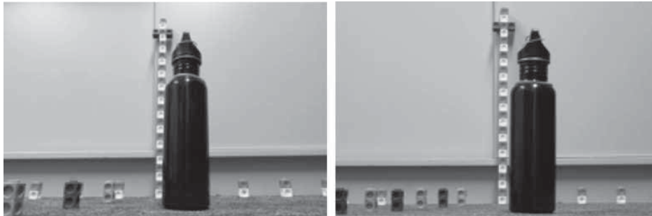
Figure 8. A water bottle photographed at a distance of 20cm (on the left) and 60cm (on the right) from a block tower. The photo on the left was taken with a zoom lens and the second with a wide angle lens.

I presented this problem to a friend of mine, and he suggested that if you have an estimate for the actual wingspan of the plane (it looks to me like an Airbus A320) and compare this with the amount of ground that is spanned by the wings using the scale, then you should be able to deduce the height. Unfortunately, this method would require more information than is available from just the imagery. The two images in Figure 8 show a drink bottle and a tower made of blocks. In both images the bottle appears as the same height as the tower, and yet in the first photo the bottle is only 20cm from the tower, while in the second photo the bottle is 60cm from the tower (the solid coloured blocks on the left side of the bottle are spaced at 10cm intervals from the tower, and since more are visible in the second photo the bottle is further from the tower). So, why does the bottle appear to be the same size as the tower in both photos? Simple: I adjusted the zoom setting on the camera. This suggests that looking at the size of the plane and the ground alone is not enough to tell us how high the plane is.