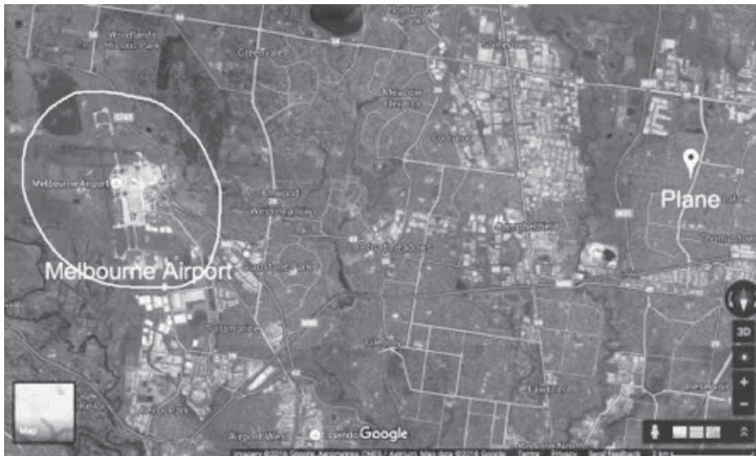
Figure 7. Position of the plane in relation to Melbourne Airport.

It should be noted that the plane was about 14km away from Melbourne airport at the time (see Figure 7). Aircraft descend at a range of angles, although about 3^\circ is a suggested estimate for commercial aircraft on a standard approach (see http://www.ifly.com/blog/from-the-cockpit/approach-and-landing/ ). Using trigonometry, our computed altitude of 658m when 14km from landing gives a descent angle of about 2.7^\circ which suggests that our height estimate may not be too bad.