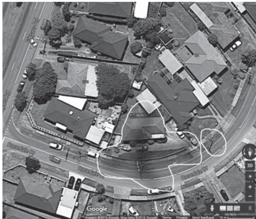
Figure 3: A close-up view of the plane's shadow, to prove that I am not imagining it. The plane's shadow and a nearby electricity pole are highlighted.