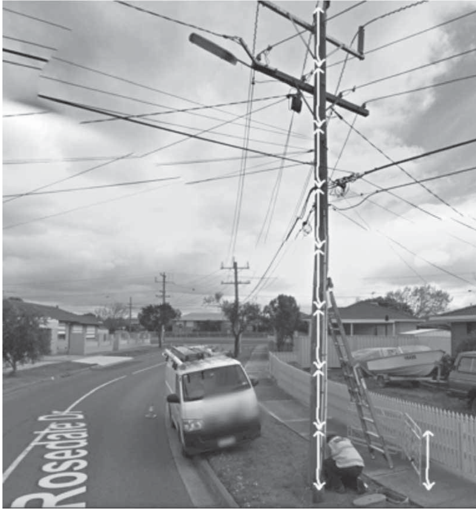
Figure 5: Google Street View image of the street containing the electricity poles near the plane's shadow, showing how to estimate the height of the pole.

view until I could see it (see Figure 5). Very conveniently there were some visual clues I could use to estimate the height of the pole: a man, his van, some workplace fencing, and a ladder.