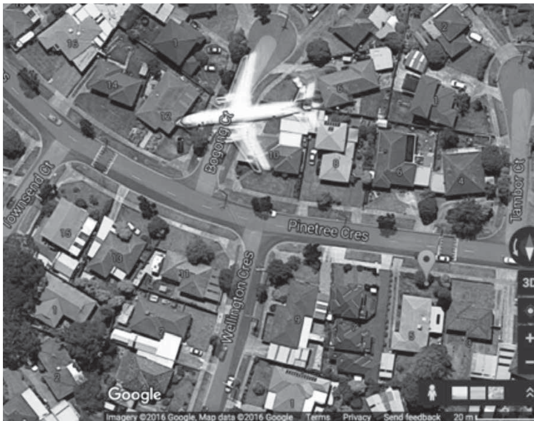
Figure 1. Jet plane over Melbourne's northern suburbs.

That particular image has now disappeared from Google's satellite images, but careful searching of current imagery (as at 7 November 2016) reveals another plane, caught in flight over Melbourne's suburbs. Figure 1 can be found using the following coordinates in Google Maps, with satellite view turned on: -37.6680 145.0028 (or S 37.6680 E 145.0028).