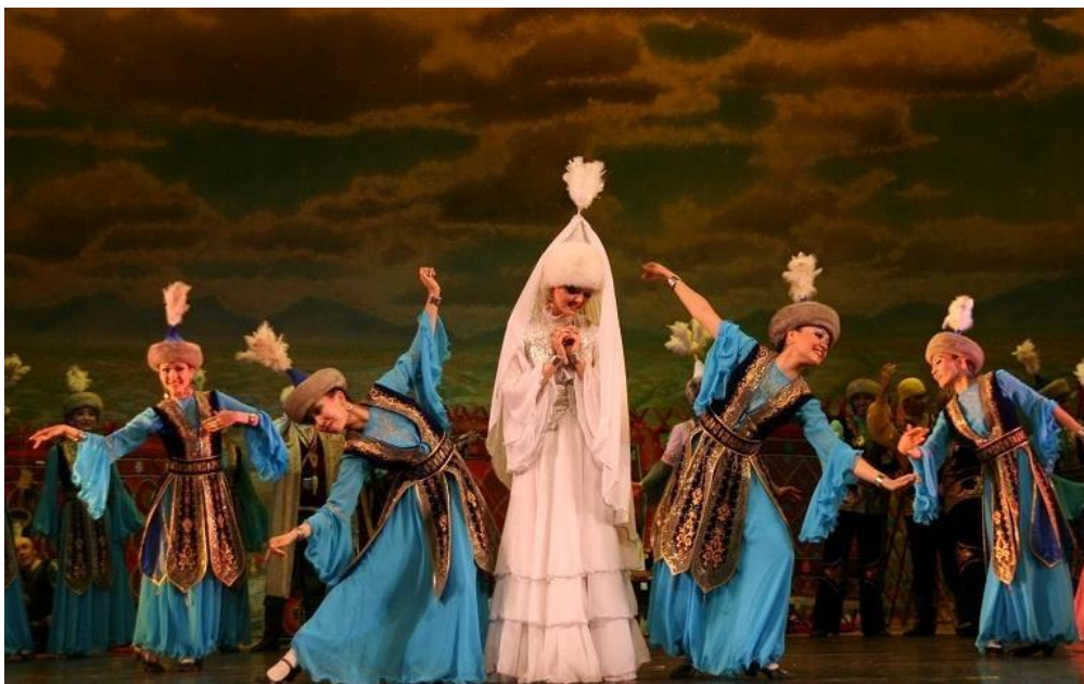
Figure 3. The Kazakh wedding dance "Koshtasu" performed by the State Dance Theatre "Naz"