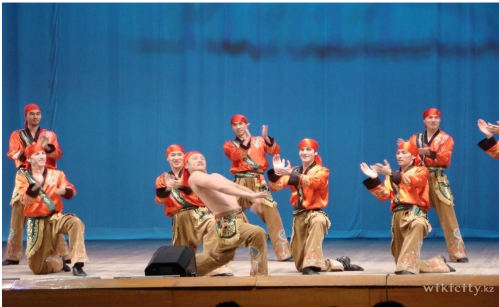
Figure 2. The Kazakh folk dance "Buyn bi" (dance of the joints) performed by the State Dance Theatre "Naz"