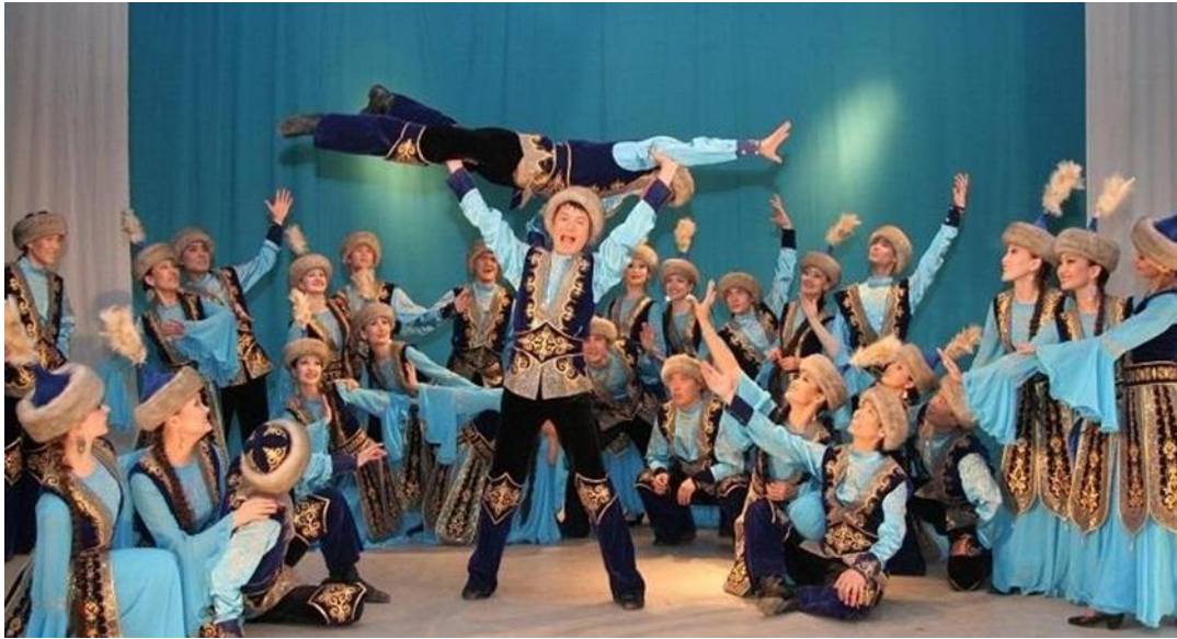
Figure 4. Folk dance "Utys bi" (contest dance-) in the performance of the State Dance Theatre "Naz"

L.P. Sarynova (1976), who studied the Kazakh national dance, the author of numerous books on the art of Kazakhstan, wrote: "The old folk dances, which traces were found, were not the "rudiments of a primitive dance or their elements; they presented the original dance art, which distinctive means were determined by the culture of a patriarchal-feudal society".